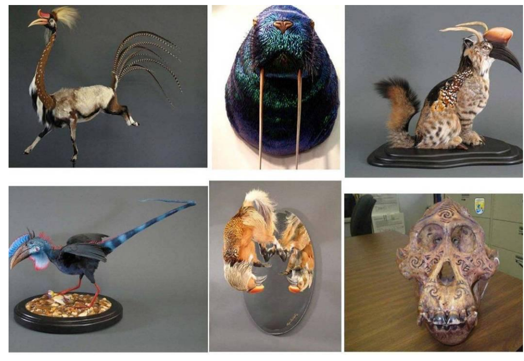
Taxidermy pieces constructed from parts of endangered and protected wildlife. See U.S. v. De Molina inside, for more details.