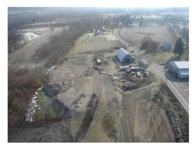
Aerial view of farm

Eagle Recycling pleaded guilty to conspiring to violate the Clean Water Act and to defraud the United States (18 U.S.C. §§ 371, 1343; 33 U.S.C. §§ 1311(a), 1319(c)(1)(A)) for its role in the creation of a massive, asbestos-contaminated dumpsite that has been designated a Superfund site. This unpermitted dumpsite was located on a farmer's open field, which also contained wetlands, and is adjacent to the Mohawk River.