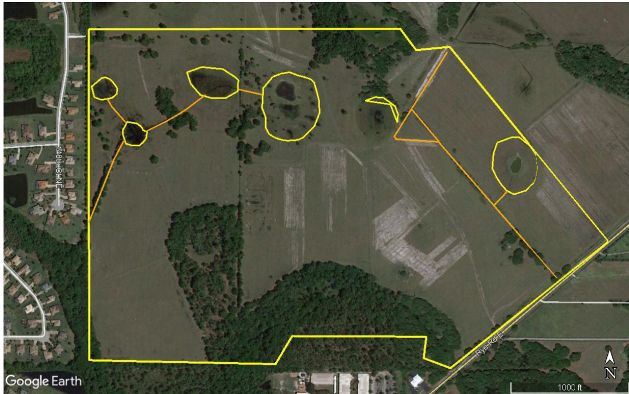
January 28, 2019 Google Earth Aerial Photo