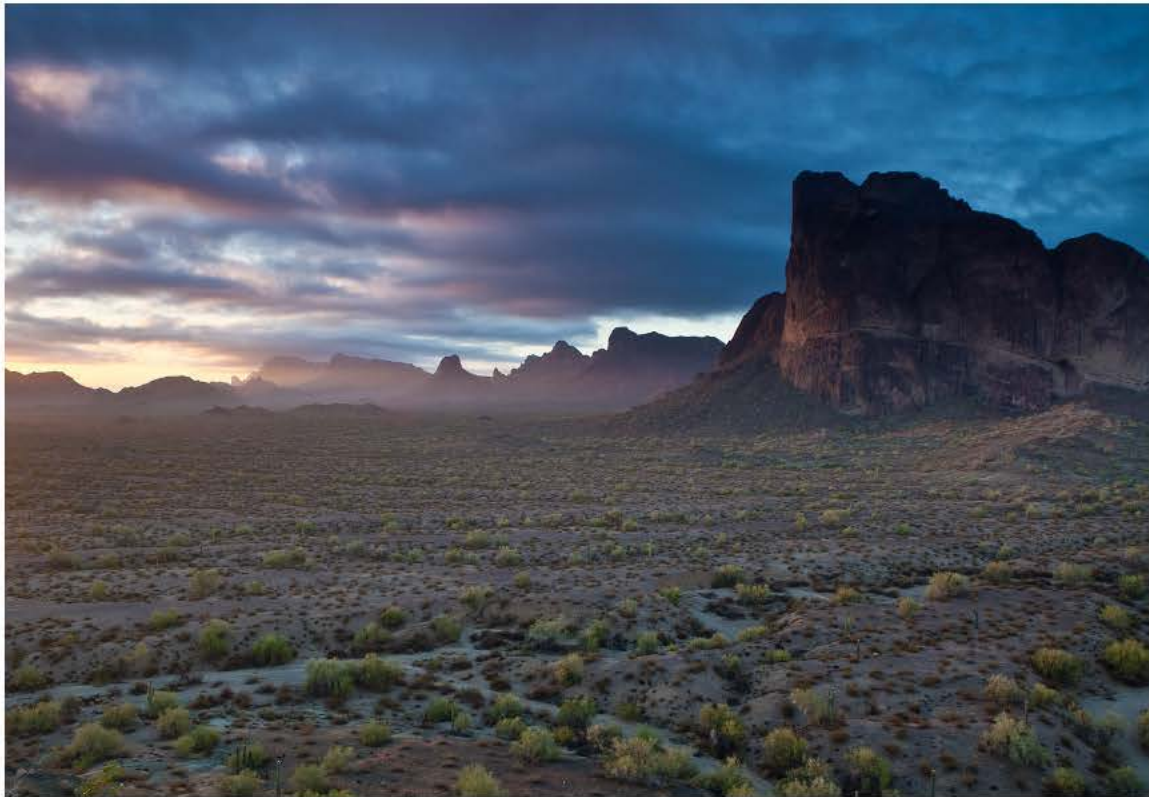
Eagletail Mountains Wilderness, Arizona, Bureau of Land Management