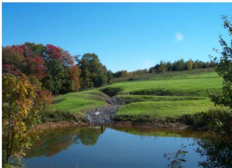
De Sale Restoration Area Phase 3 Settling Pond, Seaton Creek, Butler County, Pennsylvania, EPA