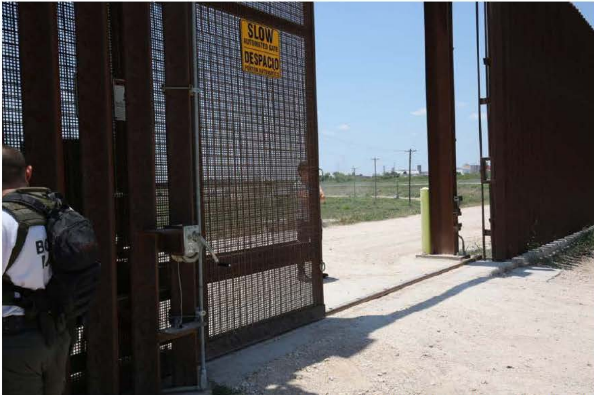
Automatic Gate in Brownsville, Texas, Customs and Border Protection