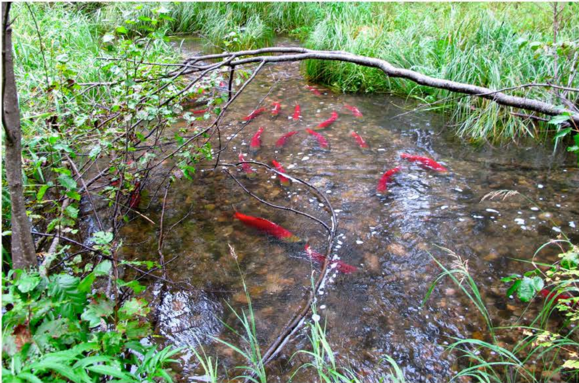
Sockeye Salmon in a Small Stream, Fish and Wildlife Service