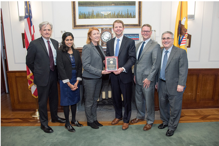
ASPCA's Champion for Animals Award presented to the Environmental Crimes Section for having shown outstanding dedication to end dogfighting in their communities.