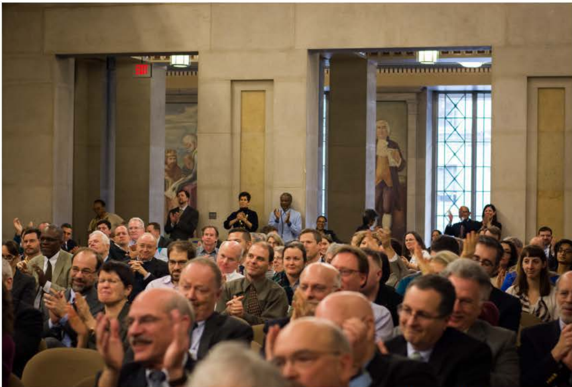
Assembly in Great Hall, Department of Justice