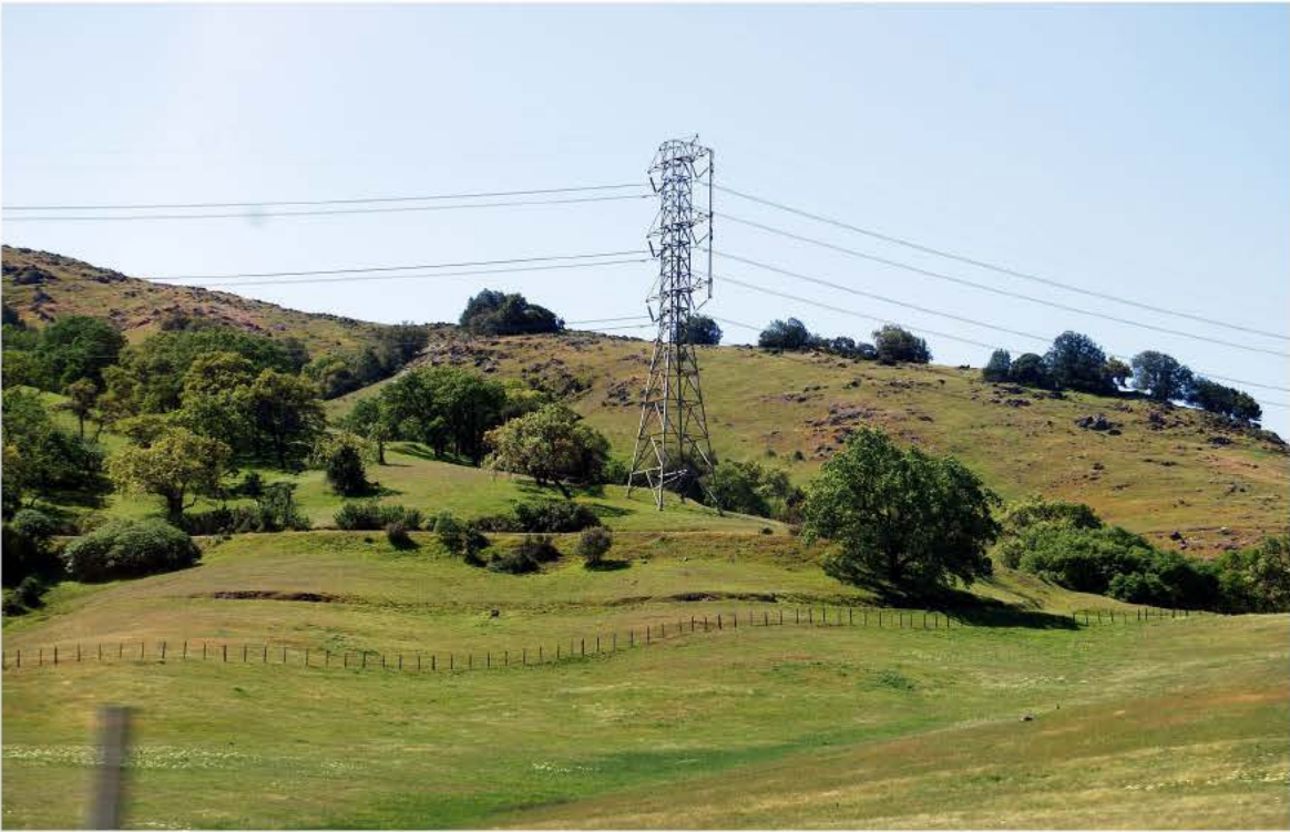
Electrical Transmission Tower