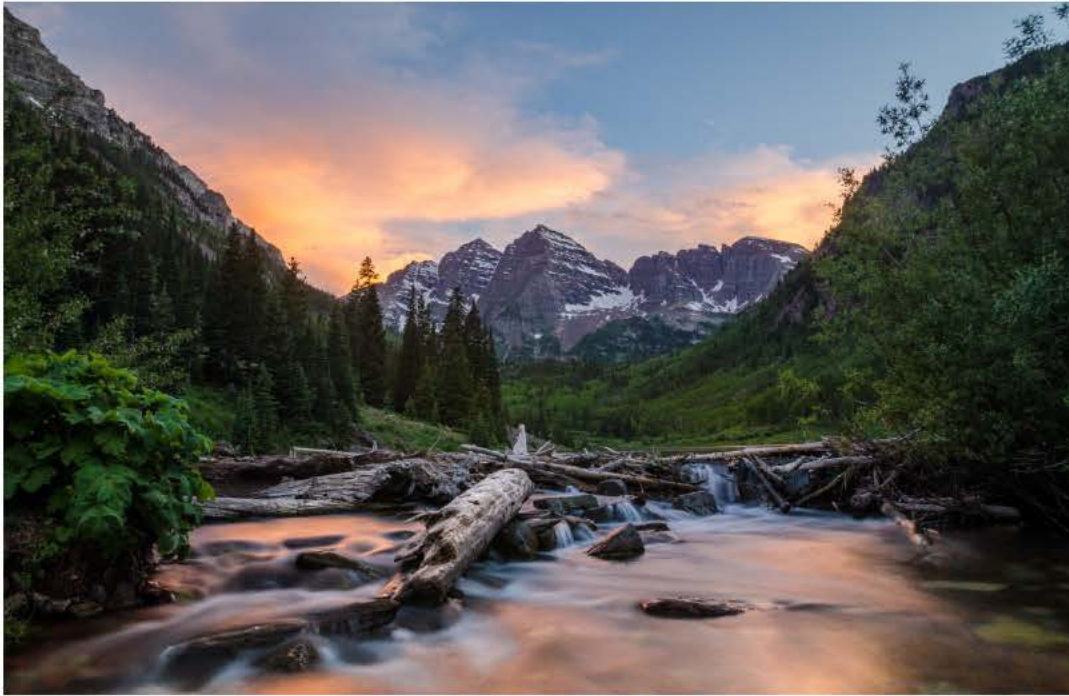
White River National Forest, Colorado, Department of Interior