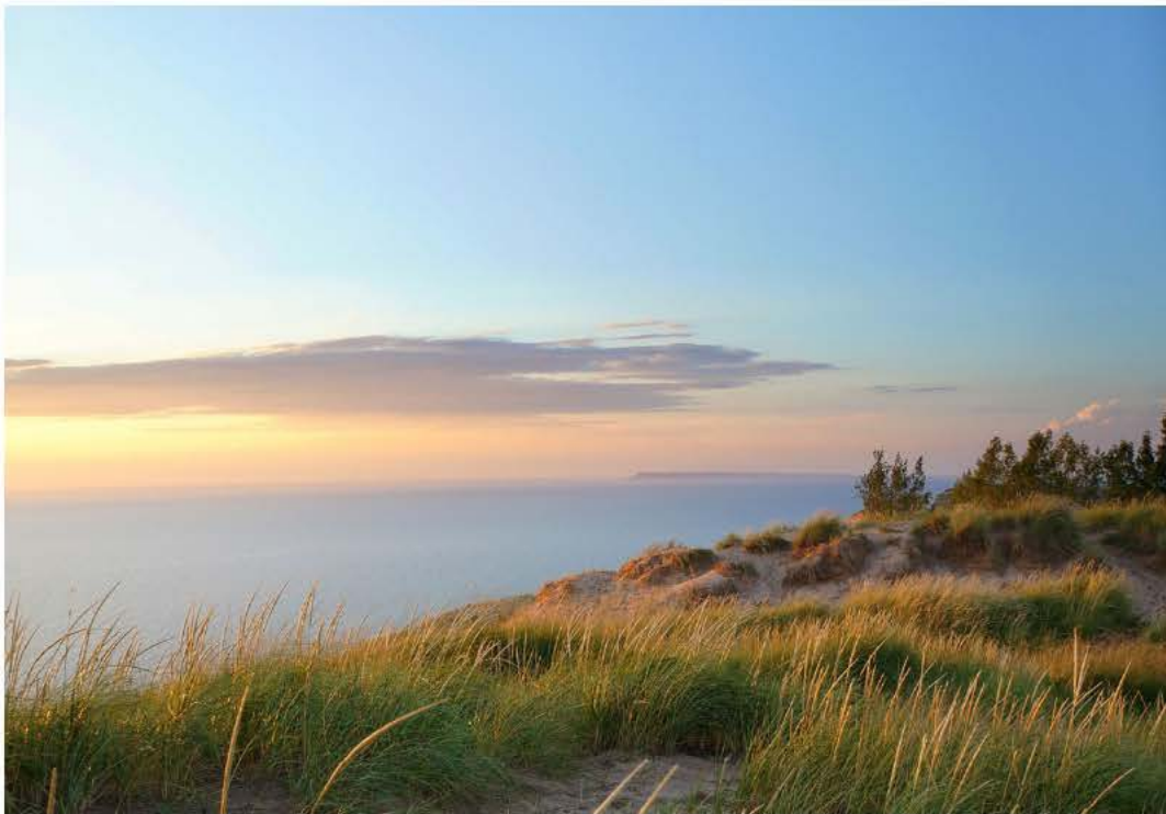
Sleeping Bear Dunes National Lakeshore in Michigan, Department of Interior