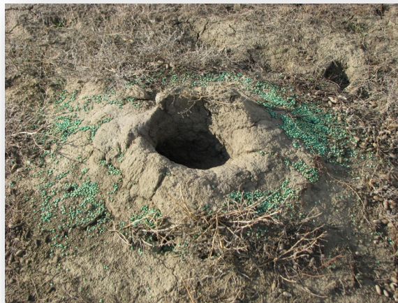
Bait placed around prairie dog holes

The U.S. Fish and Wildlife Service, the U.S. Environmental Protection Agency Criminal Investigation Division, the Standing Rock Sioux Tribe Game and Fish Department, and the North Dakota Department of Agriculture conducted the investigation.