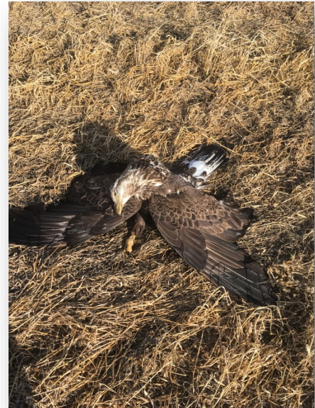
Deceased Bald Eagle recovered by local game officials.

The U.S. Fish and Wildlife Service; the South Dakota Department of Game, Fish, and Parks; and the Faulk County Sheriff's Department conducted the investigation.