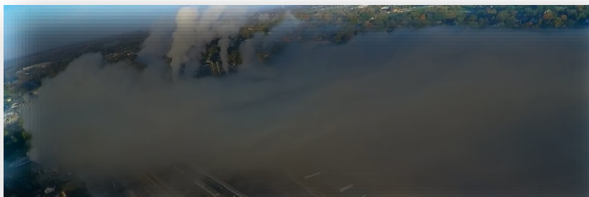
Toxic chlorine gas cloud

On May 27, 2020, a court sentenced Harcros Chemicals, Inc., and MGP Ingredients, Inc., (MGPI) to each pay $1 million fines for violating the Clean Air Act for causing the release of a toxic chlorine gas cloud over Atchison, Kansas, in 2016 (42 U.S.C. § 7413(c)(4)).