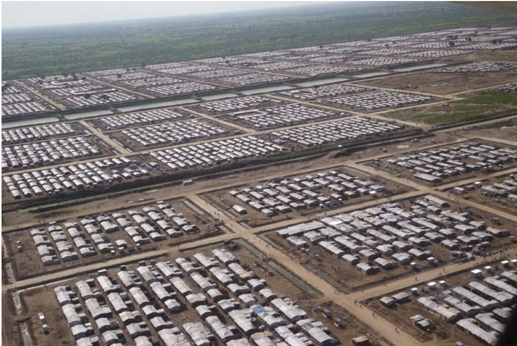
Aerial view of the UNMISS PoC site in Bentiu. June 2016.

Nyawal sought refuge in the Bentiu PoC site in early 2015, escaping an attack on her village in Guit county. She was raped by an SPLA soldier a few months after arriving at the PoC site when she ventured out to buy medicine.