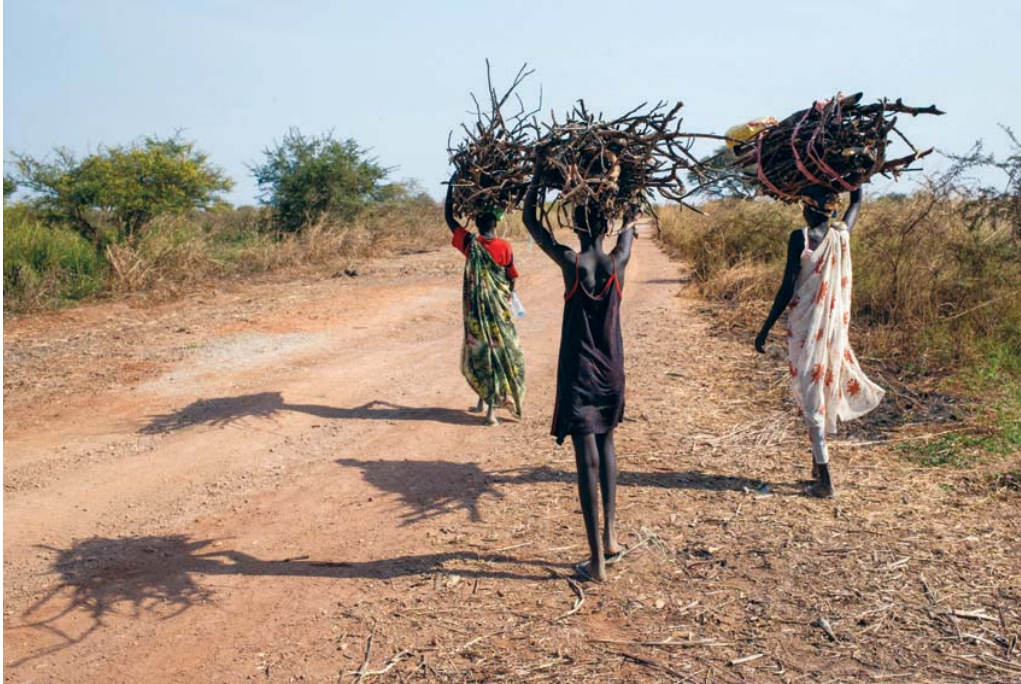
Women returning with collected firewood to the UNMISS PoC site in Bentiu, January 2015.

Nyawal was treated for her rape by Médecins Sans Frontières (MSF) and also received support from the International Rescue Committee (IRC), which provides counselling for survivors of sexual violence in the Bentiu PoC. Her experience caused her significant mental anguish.