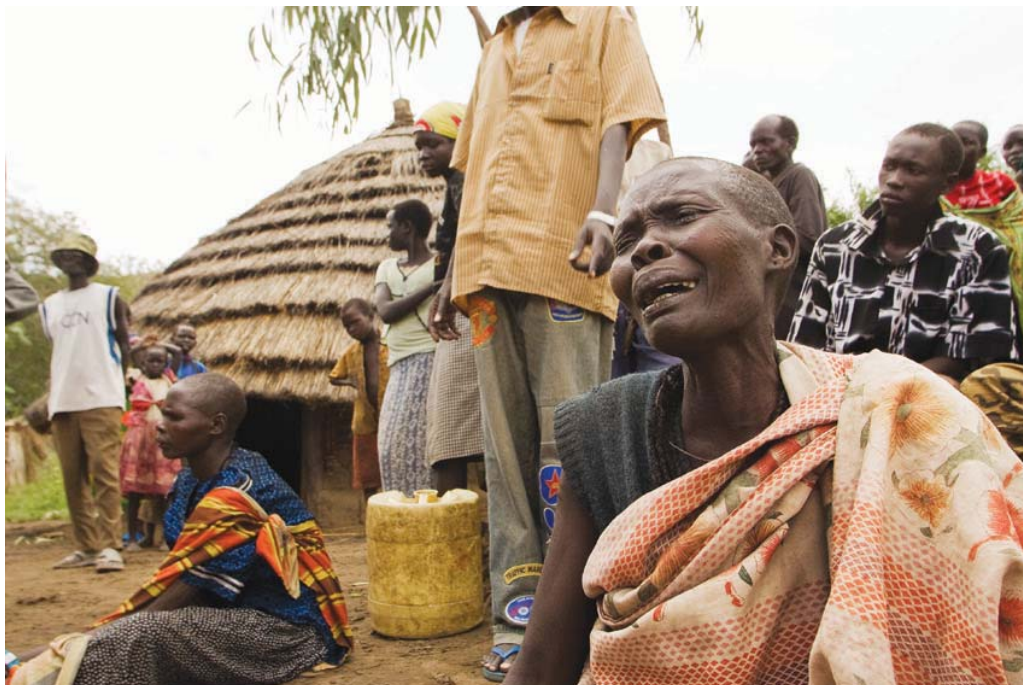
A woman cries following a deadly attack by cattle raiders. Chukudum, Eastern Equatoria state, 2007

The armed conflict that erupted in December 2013 is only the most recent episode of violence in South Sudan's history. From 1956 to 1972 and again from 1983 to 2005, the Government of Sudan and pro-government militias fought against armed groups who sought greater equality and autonomy for the southern regions of Sudan. Both periods of civil war were characterised by extreme violence against civilians, gross human rights abuses, and massive forced displacement. During the second civil war from 1983 to 2005, an estimated 1.9 million people—one out of every five southern Sudanese—were killed or died from disease and famine, and some four million people were internally displaced. 2