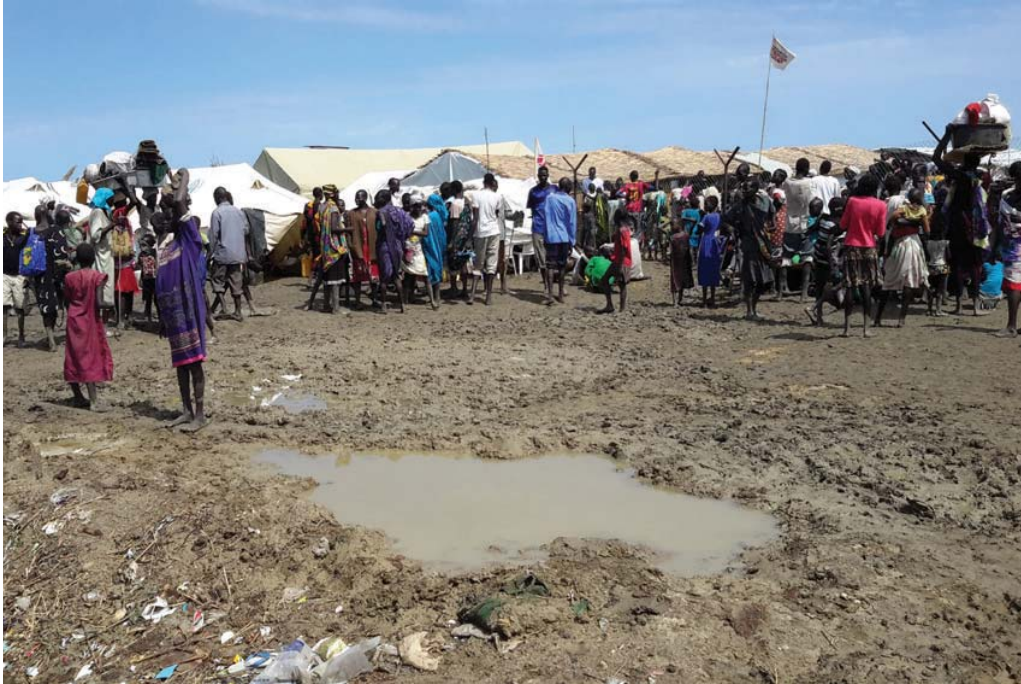
Newly arrived internally displaced people register at UNMISS PoC site in Bentiu, Unity state, May 2015.