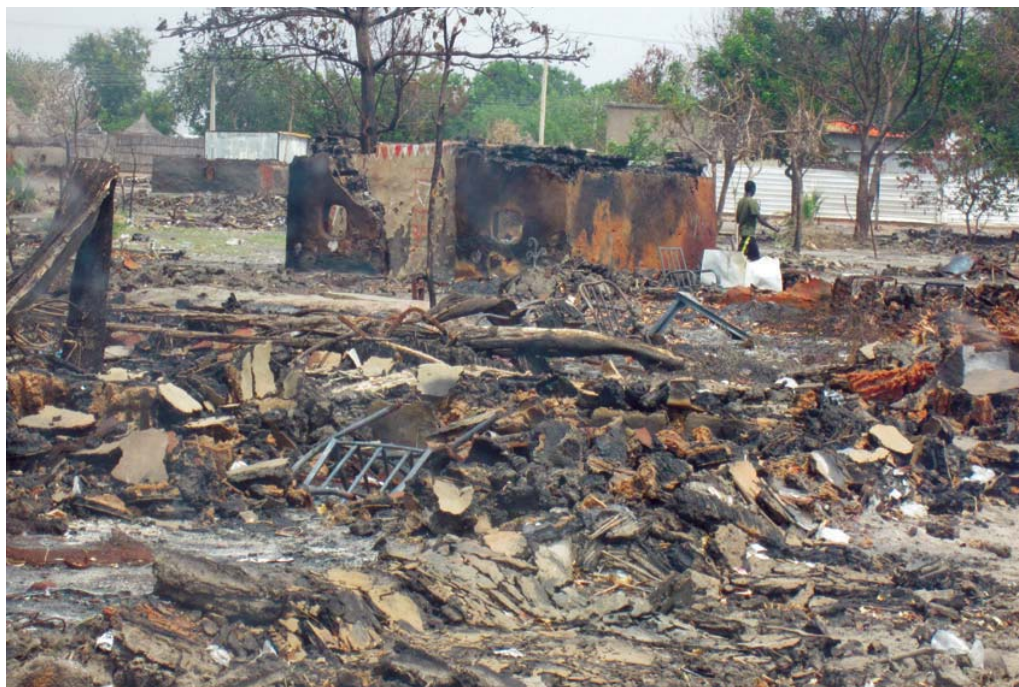
The conflict resulted in the destruction of homes, hospitals, and other buildings. Bentiu, South Sudan, March 2014.

In December 2013, growing political tension between President Salva Kiir and Dr Riek Machar mushroomed into a brutal internal armed conflict. 4 Fighting started in Juba, the capital, where government forces engaged in targeted killings, primarily of Nuer men. Security forces across the country split—with some maintaining allegiance to the government and others defecting to support the armed opposition under Machar, which came to be known as the Sudan People's Liberation Movement/Army-In Opposition (SPLM/A-IO). By the end of 2013, the conflict had engulfed parts of Jonglei, Unity, and Upper Nile states. 5