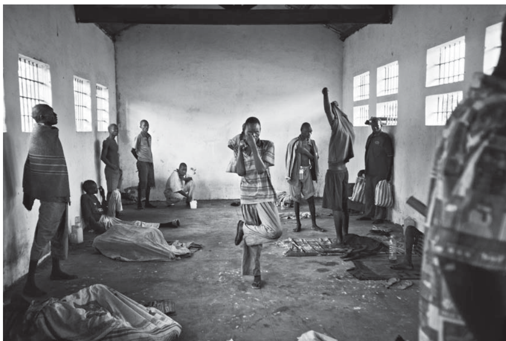
People with suspected mental conditions are routinely detained in prisons. Juba Central Prison, Juba, South Sudan, 2011.

The routine use of prisons to house individuals with mental health conditions is a stark manifestation of the inadequacy of mental health treatment, stigma about mental disorders and the deficit of facilities and trained staff. Individuals with mental health conditions deemed to pose a danger to themselves or others often end up arbitrarily detained in prison, even if they have not committed any crime. They may be transferred to prison from medical facilities or taken directly to prison by family members who feel unable to care for them. In May 2016, there were 66 male and 16 female inmates in Juba Central Prison categorized as mentally ill, more than half of whom had no criminal files. 92 According to a former health worker at Malakal Hospital, prior to the conflict, there were 27 people with mental health problems in the Malakal prison. “Some were brought to prison by family members because they were violent, aggressive, and suicidal,” he explained. 93