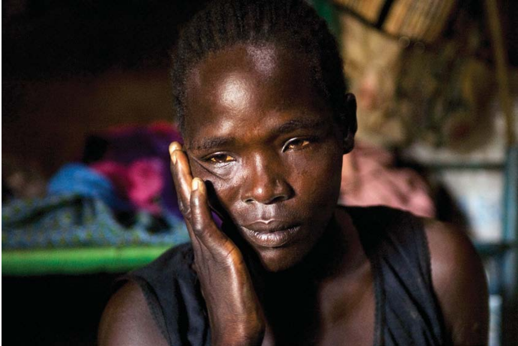
A woman whose husband was killed by an unknown armed group the previous night. Gumbo, Central Equatoria state, 2006