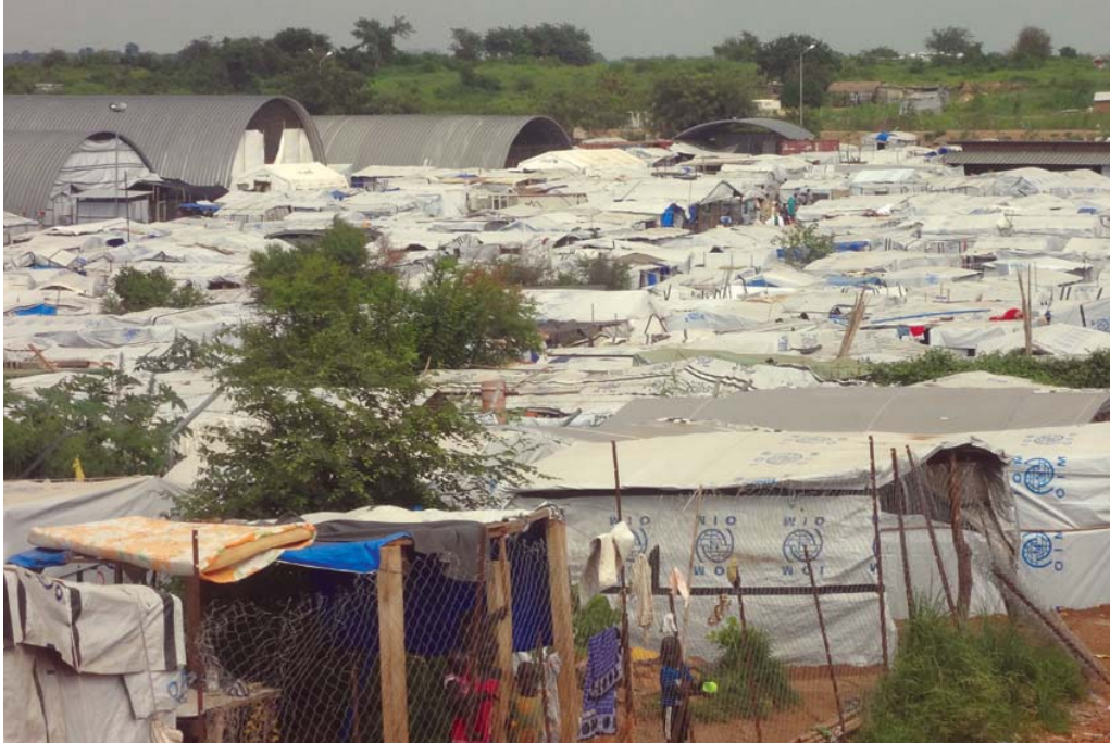
UNMISS PoC site in Juba, South Sudan. 2014

I tried to go to school here but found that I could not concentrate even on the easy things. They just opened a school here, but my thoughts distract me. When I sit still, my mind just goes to other things like my children."