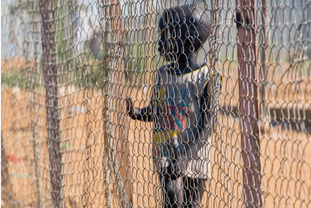
A child at the UNMISS PoC in Juba. 2015

"I am unable to sleep. My wife appears in my dreams. Sometimes she blames me for not performing the required funeral rites...I didn't go to church; I blamed God. When I would go to church I would just cry. My wife used to sing in church. I would remember her voice, how she used to sing."