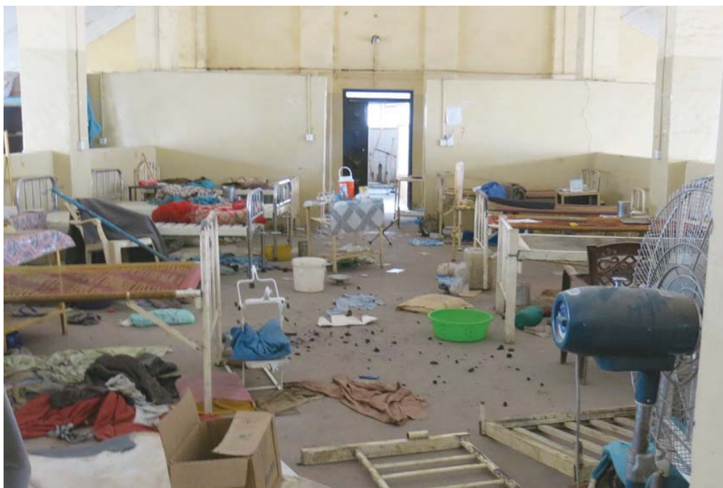
A ward in Malakal Teaching Hospital, where patients and displaced people who had taken refuge were killed by opposition forces in late February 2014. Malakal, Upper Nile state, March 2014.

"She can't manage—she's not normal. She can talk but it's senseless. She quarrels with the children. She cooks, but like a child, she burns things. She knows the children's names, but she does not know their ages. It is the children who tell her to do the things she should do. She can't identify what is happening...Sometimes I pray to God to help her." 51