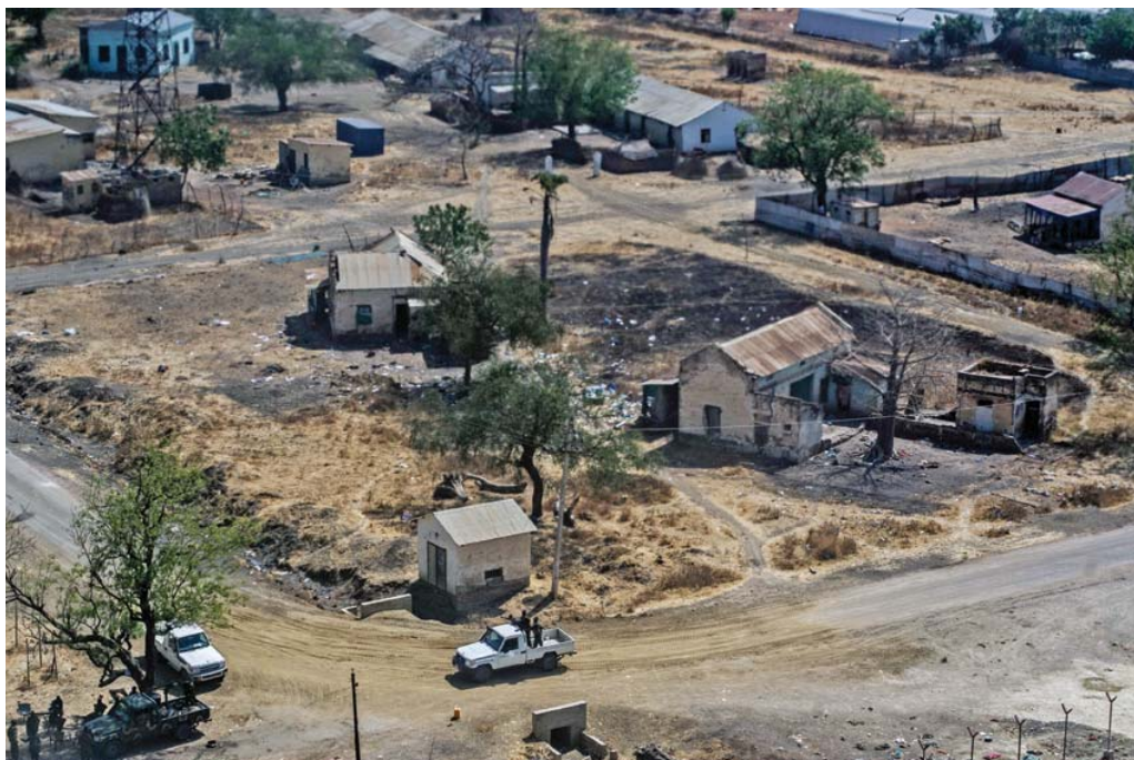
A view of the deserted streets in Malakal, Upper Nile state in January 2014 after residents fled violence between government and opposition forces.

Ajak fled to the Malakal UNMISS base on 25 December 2013, during the first attack on Malakal by opposition forces.