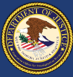
Figure 4 Next