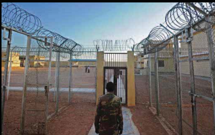
A prison warden at a prison in Garowe, Puntland state, in northeastern Somalia, December 2016. Fifty-four boys, some as young as 12, sent to fight by Al-Shabab in Puntland, spent months in this facility far from their homes. A military court sentenced 28 of the 54 boys to long prison terms, which they are now serving in a rehabilitation center in Garowe.

Human Rights Watch calls on the Somali government to end arbitrary detention of children and allow for systematic independent oversight of children in custody. Children taken into custody should be promptly transferred to child protection actors for rehabilitation and – when feasible – reintegration. Children accused of serious crimes should be tried by civilian courts in line with juvenile justice standards.