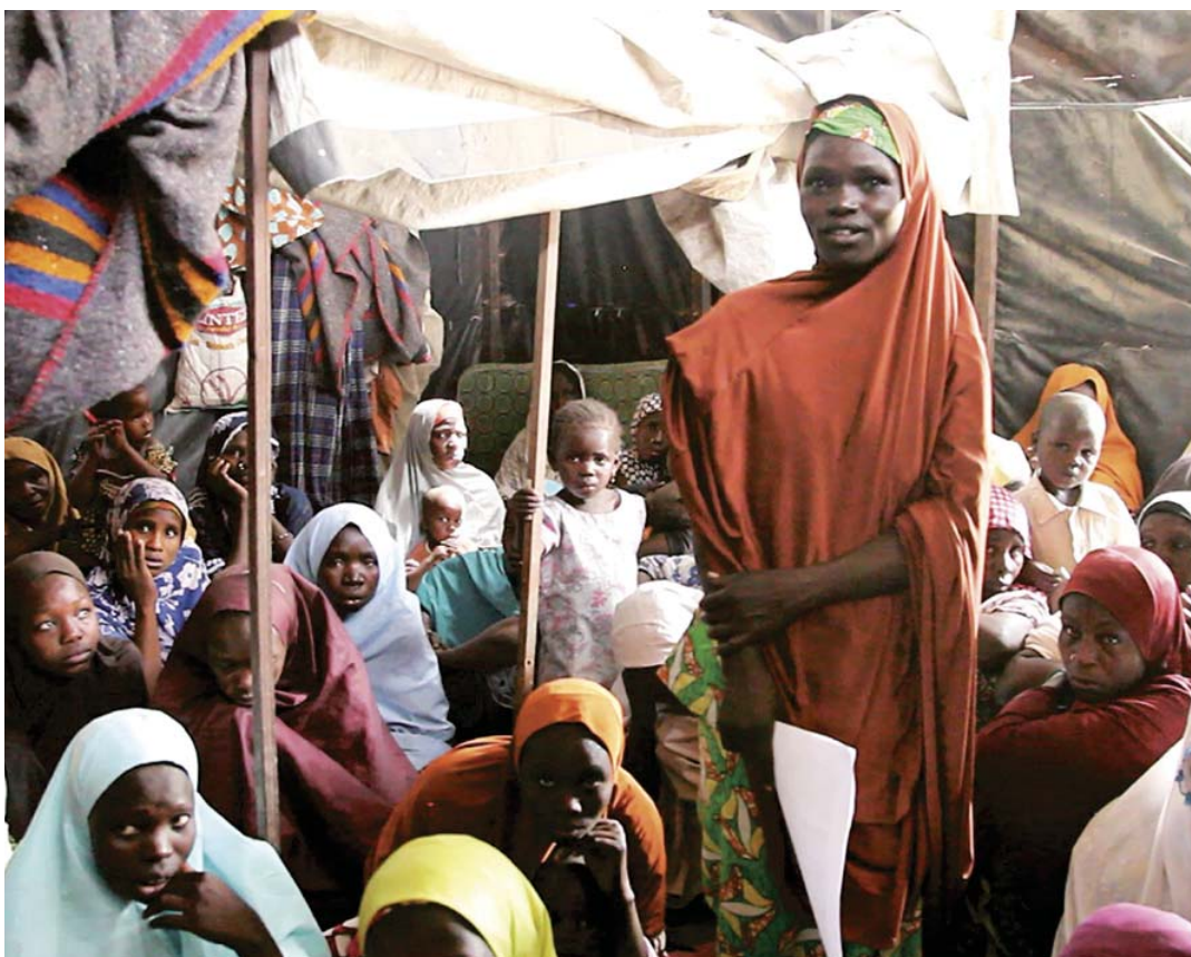
← In a Maiduguri camp for internally displaced people, one of Knifar's leaders speaks at a meeting as they plan advocacy efforts for their husband's release and for justice for the abuse they have suffered. March 2018.