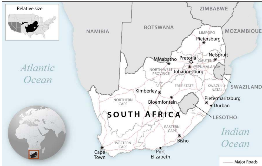
Figure 2. South Africa at a Glance (2018 data unless otherwise noted)