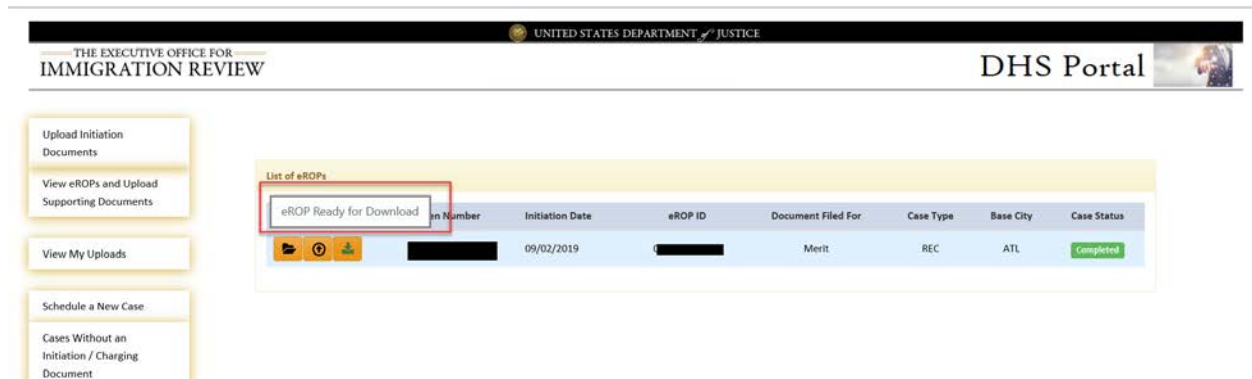
Figure 4: Message indicating that the eROP is ready to download

After selecting to download an eROP, the user must wait until the system has finished processing the request to download the eROP contents. With this enhancement, a message indicating that the eROP download is ready, will appear when the user hovers the pointer over the Download Icon. The user also will receive instant notification that the download is ready, wherever the user is, within the application.