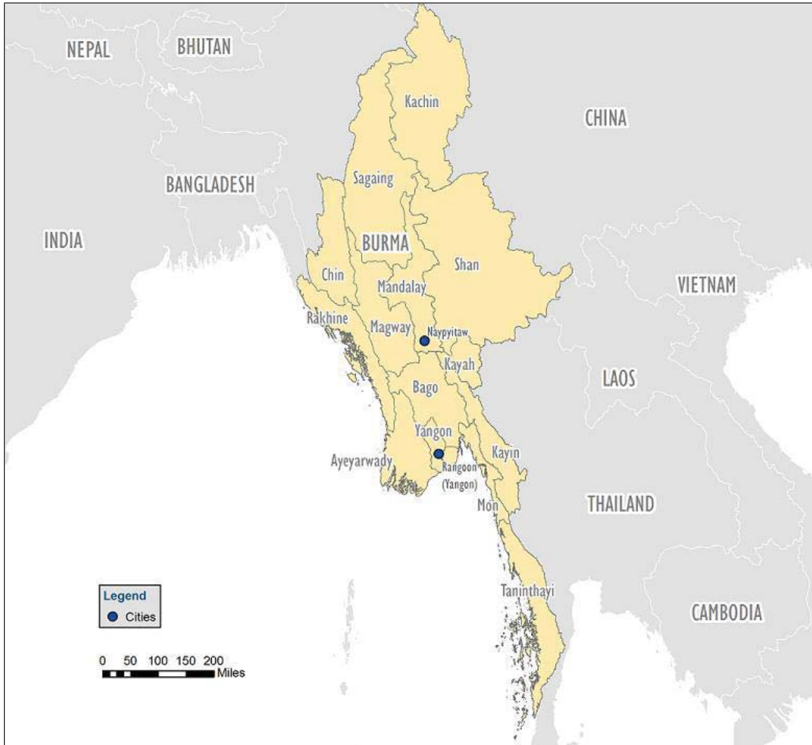
Figure 2. Map of Burma Showing States and Regions