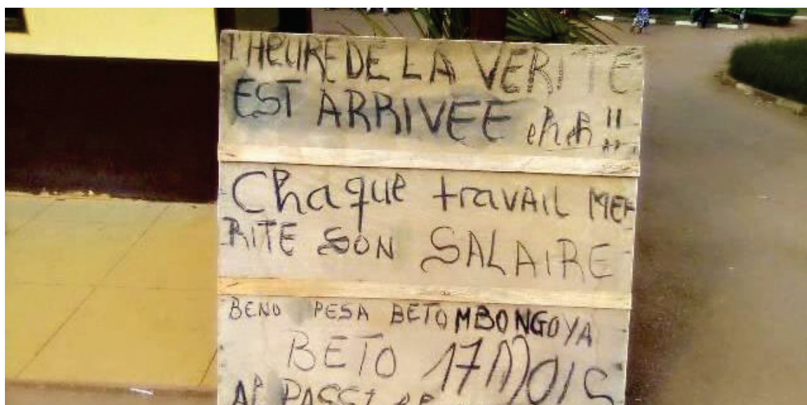
↑ Placard at Dolisie General Hospital, September 2020

In Dolisie, on 18 September 2020, the Fenagas branch at the general hospital announced they would be stopping work as of 21 September, following the “failure of negotiations with the hospital’s general management concerning the payment of at least ten months of salary arrears out of 16”. 133 The hospital had already suffered a strike on 24 December 2018 134 when workers demanded several months of unpaid wages and their registration with the National Social Security Fund. The three hundred providers were denouncing 24 months of unpaid salaries. 135