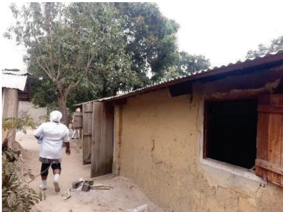
↑ Loulumbo Integrated Health Centre