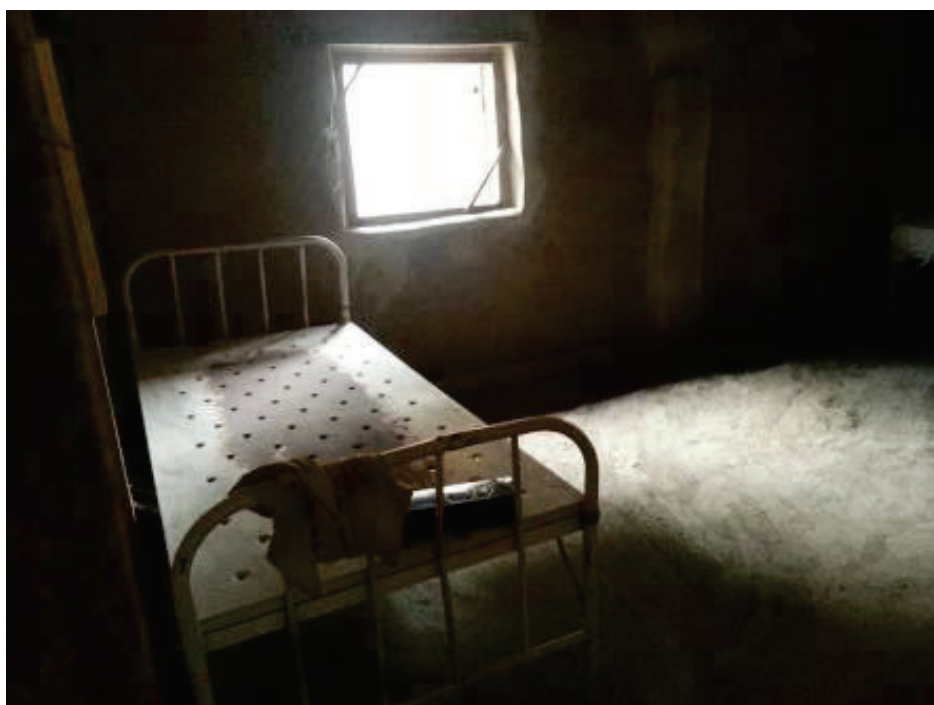
↑ Loulumbo Integrated Health Centre