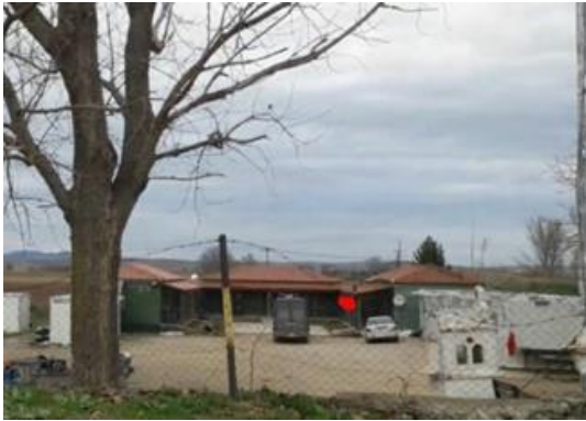
← The Poros facility, as marked by Tarik Photo by Lena Karamanidou, 'Figure 4: Video Still of the Poros facility', from Lena Karamanidou, Bernd Kasperek, 'Hidden infrastructures of the European border regime: the Poros detention facility in Evros, Greece', 8 March 2020. respondmigration.com/blog-1/border-regime-poros-detention-facility-evros-greece

Tariq and Rima, whose case is discussed in Chapter 4, told Amnesty that they were detained incommunicado in two separate sites before being forcibly returned on 14 September 2020. The couple reported being detained first in a site around the center of the city of Komotini , 74 then transferred to a second site in Poros . Based on information received by the organization, they were not registered nor granted an opportunity to seek asylum in either of the two facilities. They eventually identified the second facility as the site the CPT refers to as “ Poros detention facility under the jurisdiction of the Feres Police and Border Guard Station ,” discussed above.