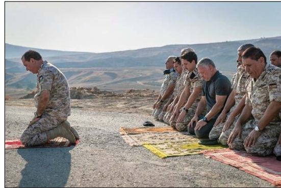
Figure 2. Jordanian Officials Pray at Recently Reclaimed Area from Israel