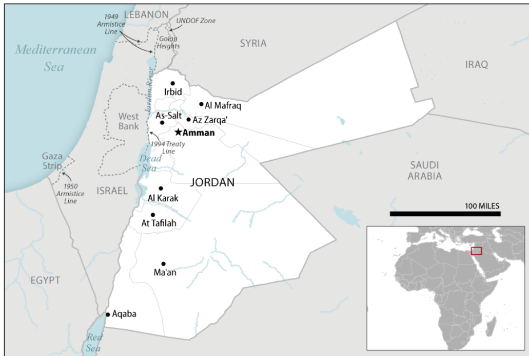
Figure I. Jordan at a Glance

Area: 89,342 sq. km. (34,495 sq. mi., slightly smaller than Indiana)