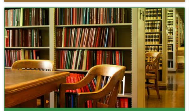
Research & Capacity Building