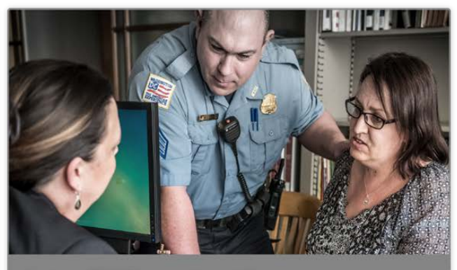
Law Enforcement & Prosecution