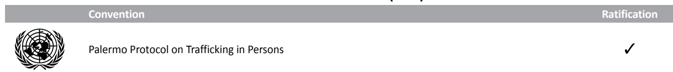
Table 3. Ratification of International Conventions on Child Labor (cont)

The government has established laws and regulations related to child labor (Table 4). However, gaps exist in Bahrain’s legal framework to adequately protect children from the worst forms of child labor, including the prohibition of commercial sexual exploitation of children.