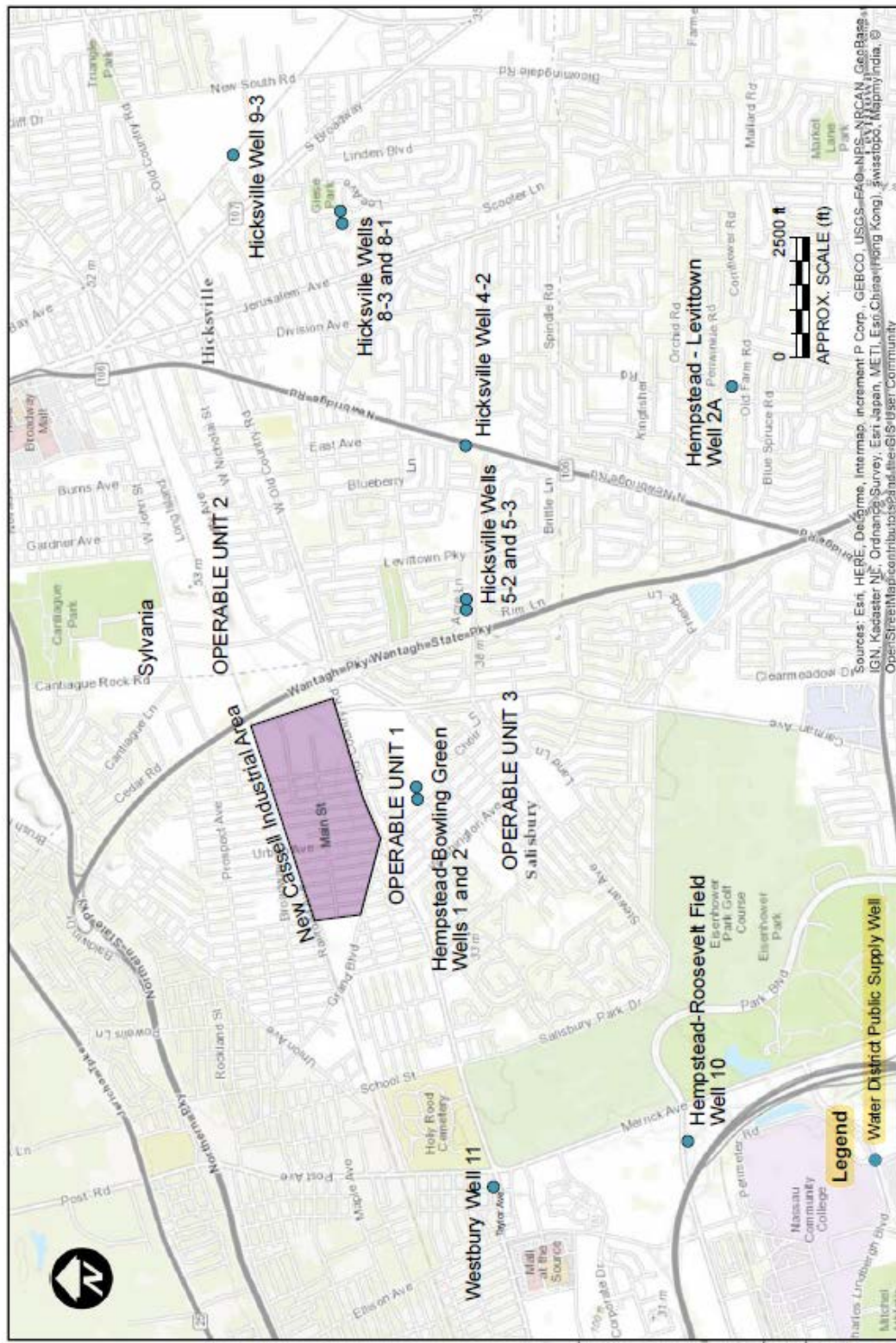
Figure 1 Site Location Map