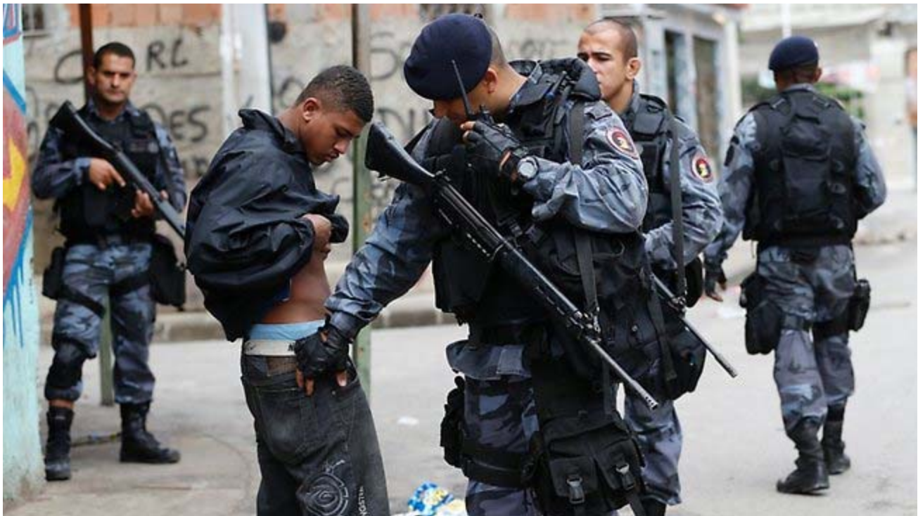
Brazilian police are known for their brutality

Tools and Data (/component/tags/tag/137-tools-and-data) Homicides (/component/tags/tag/170-homicides)