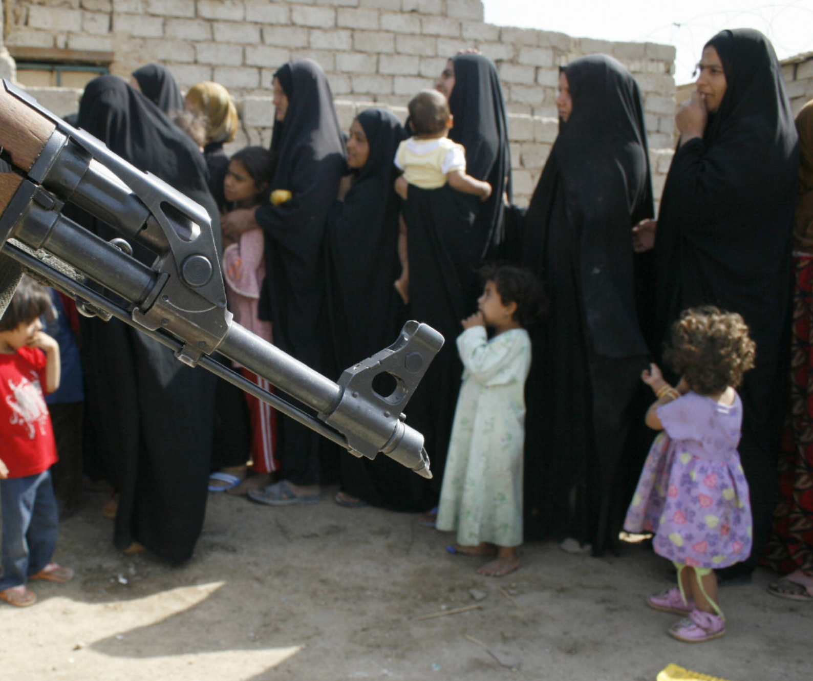
Iraqi women with their children wait to receive humanitarian aid, southern Baghdad, 2007.

to use violence against their wives. The “exercise of a legal right” to exemption from criminal liability is permitted for: “Disciplining a wife by her husband, the disciplining by parents and teachers of children under their authority within certain limits prescribed by Islamic law (Shari’a), by law or by custom.”