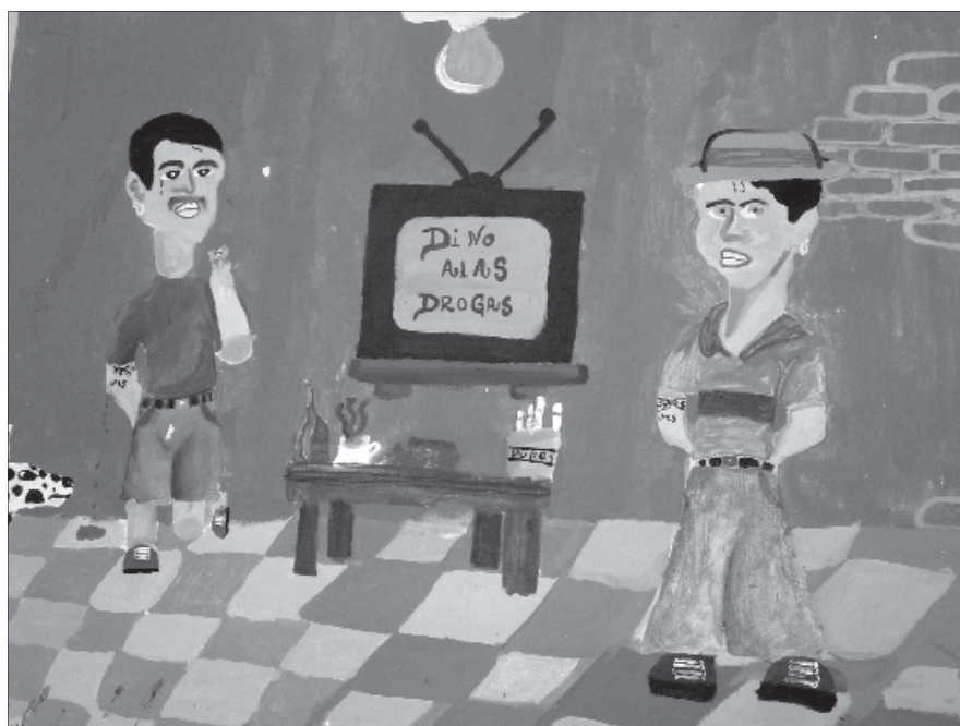
Painting by a young person participating in a prevention and rehabilitation program that reads, “Say no to drugs.”

Because evidence suggests that the most effective prevention programs build on community assessments and local partnerships, backed up by national resources, prevention program design should begin with a broad evaluation of the current situation in the various provinces and highly populated urban centers in each country, taking stock of the existing prevention, intervention, and rehabilitation programs run by community organization and churches. Because of a severe lack of resources and funding for social services in Central America, using these existing programs as a base to creating a comprehensive approach is the most cost