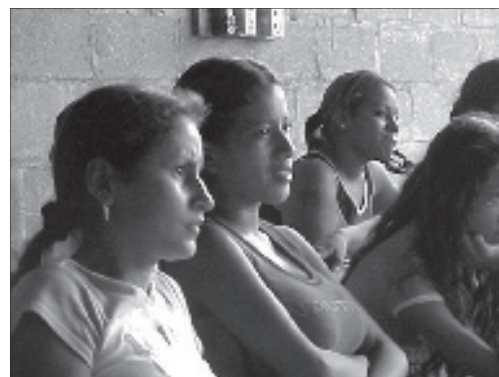
Young women at a center for at risk youth in Honduras.

Given these costs, effective violence prevention programs could save enormous