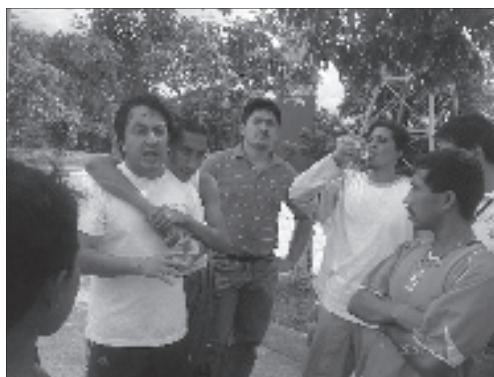
Guatemalan youth congregate at a rehabilitation center.

Several broad social factors contribute to youth violence in Central America. One of the factors most strongly associated with violent behavior by teens and young adults is exposure to violence in the home. Children who experience, or observe, violent behavior in the home are far more likely to engage in violence themselves. Unfortunately, intra-family violence is common in Central America. A study in El Salvador showed that physical violence is present in 80% of households there. 2 Studies show that domestic violence significantly increases the likelihood that a child will be the perpetrator of violent acts later on in life, whether they are domestic or social acts of violence. 3 In a survey of gang members in Honduras by the relief and development organization Save the Children, 38% stated that they had been beaten or abused on a regular basis during their youth. Of this group, 13.5% were beaten daily. 4 While intra-family violence is not the sole reason for