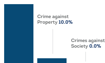
Crimes against Persons 90.0%

Step 2: Quickly follow up this report with a tip to the Federal Bureau of Investigation's (FBI) tip line at 1-800-225-5324.