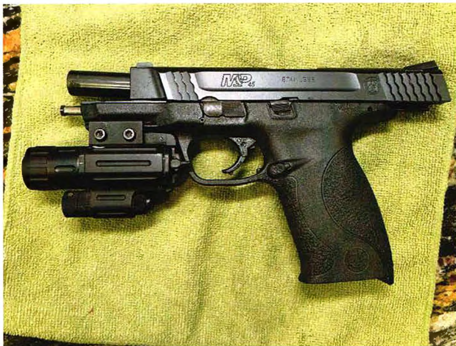
The Smith and Wesson pistol.