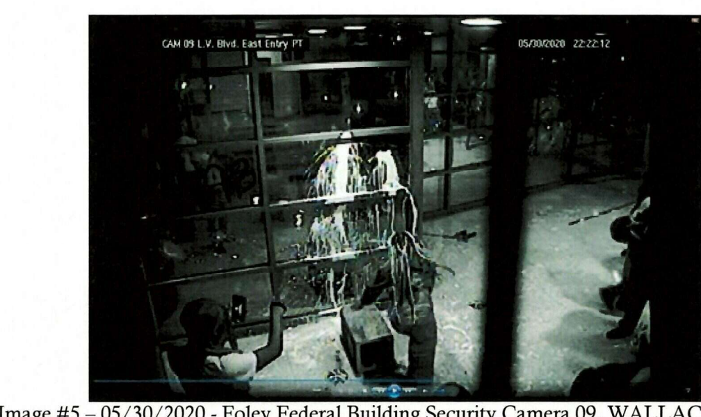
Image #5 – 05/30/2020 - Foley Federal Building Security Camera 09, WALLACE throwing what appears to be a paint can.