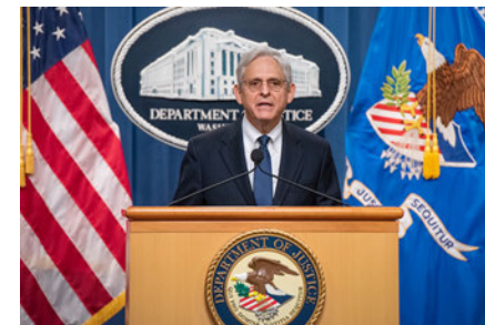
Image 03: Caption: "Third, let me address recent unfounded attacks on the professionalism of the FBI and Justice Department agents and prosecutors. I will not stand by silently when their integrity is unfairly attacked. The men and women of the FBI and the Justice Department are dedicated, patriotic public servants. Every day, they protect the American people from violent crime, terrorism, and other threats to their safety, while safeguarding our civil rights. They do so at great personal sacrifice and risk to themselves. I am honored to work alongside them." - Attorney General Merrick B. Garland.

ALT: Attorney General Merrick B. Garland speaks at a podium bearing the Department of Justice seal.