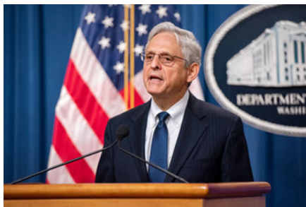
Image 02: Caption: "The Department (of Justice) does not take such a decision lightly," continued the Attorney General. "The Department filed the motion to make public the warrant and receipt in light of the former President's public confirmation of the search, the surrounding circumstances, and the substantial public interest in this matter. Where possible, it is standard practice to seek less intrusive means as an alternative to a search, and to narrowly scope any search that is undertaken. Faithful adherence to the rule of law is the bedrock principle of the Justice Department and of our democracy. Upholding the rule of law means applying the law evenly, without fear or favor. Under my watch, that is precisely what the Justice Department is doing."

ALT: Attorney General Merrick B. Garland speaks to press and media at a podium bearing the Department of Justice seal.