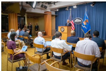
Image 01: Caption: "Copies of both the warrant and the FBI property receipt were provided on the day of the search to the former President's counsel, who was on site during the search," said Attorney General Merrick B. Garland. "The search warrant was authorized by a federal court upon the required finding of probable cause. The 'property receipt' is a document that federal law requires law enforcement agents to leave with the property owner. I personally approved the decision to seek a search warrant in this matter."

Opening description: On Thursday Aug 11, 2022 Attorney General Merrick B Garland made a statement regarding a motion filed by the Justice Department in the Southern District of Florida to unseal a search warrant and property receipt relating to a court-approved search that the FBI conducted earlier that week. That search was of premises located in Florida belonging to the former President. The Attorney General made additional comments regarding recent allegations against personnel of the FBI and Justice Department.