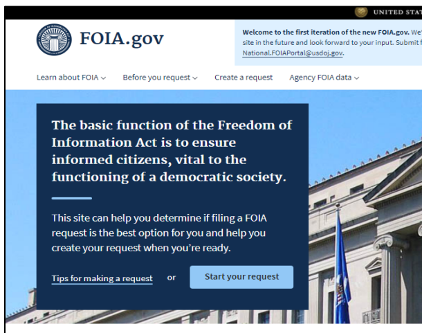
New FOIA.gov homepage

With millions of visitors since it was launched in 2011, FOIA.gov continues to revolutionize the way in which FOIA data and information is made available to the public. While it was initially a project undertaken by the Department in response to a strong interest by open government groups to have a "dashboard" that illustrates statistics