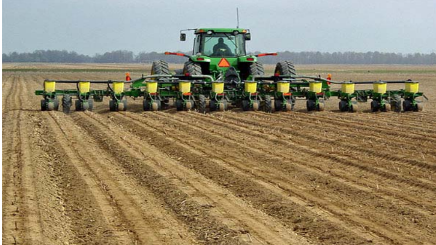
Deere 12-row Planter

12. In the United States four manufacturers account for most planter sales: Deere, Kinze, Case, and AGCO. Deere is by far the largest, accounting for more than half of new planter sales.