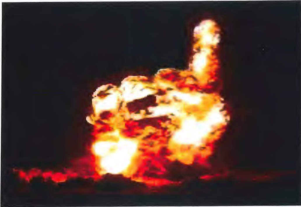
Image-1 appears to depict flames rising from an explosion, with the flames forming the shape of a hand with the index finger extended, which I recognize, based on my training and experience, as a gesture commonly used by ISIS supporters to symbolize support for ISIS.

f. On or about October 7, 2016, ABDI posted a comment stating: "Make hijra inshAllah it will help, especially to a pure Islamic state." Based on my training, experience, and participation in this investigation, I believe that ABDI was encouraging others to travel overseas to join ISIS.