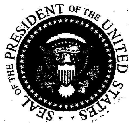
EXHIBIT B TO SECOND AMENDED COMPLAINT