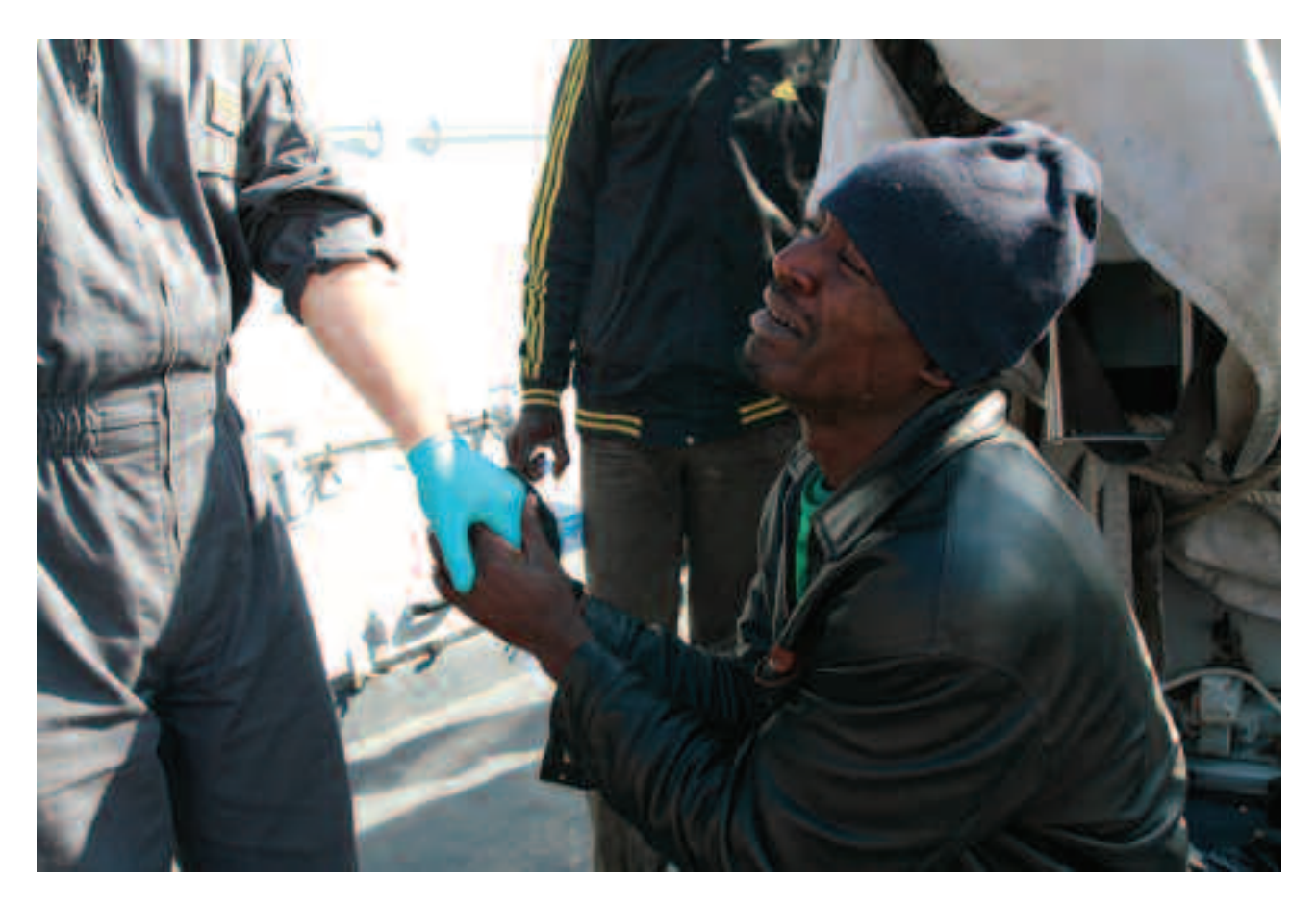
On arrival in Tripoli, one of the migrants gets down on his knees to beg an Italian officer on the Bovienzo not to send him back. The photographer reported that he said, "They are going to beat us up again, I do not want to go back to Libya."

Migrants almost universally expressed to Human Rights Watch the belief that the smugglers have close relations with Libyan officials. From migrants' accounts, the smugglers who organize the boat departures are sometimes linked to the very forces that are charged with preventing irregular maritime migration. Whether they are involved in larger smuggling operations or not, police on the roads, particularly roads leading from the borders, as well as the police guards in migrant detention centers, routinely profit by demanding and accepting bribes as the price for release from their custody. In the case of migrant detainees, this usually involves arranging contact with the families of detainees back in their countries of origin and making wire transfers of money; it often also involves the police arranging connections with smugglers for post-release travel.