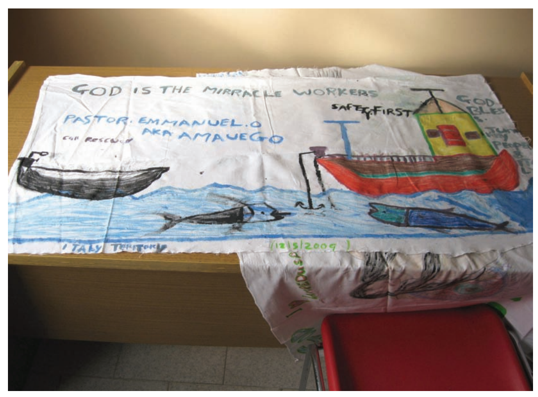
Innocent painted this picture depicting his rescue on a piece of torn sheet. To the right of the E Pinar, he has written: "God Bless the Turkey People".

Disputes over responsibility causing delayed rescues and added distress and danger are illustrated by the high profile dispute between Malta and Italy regarding responsibility for 140 migrants aboard the Turkish freighter Pinar E in April 2009. The passengers included at least one pregnant woman, children, and about 22 people who were too ill to be brought with the rest of the passengers to Sicily, but remained in Lampedusa. The captain of the Pinar E picked up the migrants in response to a distress call. Italy argued that as the migrants were intercepted in the search and rescue (SAR) zone administered by Malta they should be disembarked on Maltese territory and refused the ship permission to enter Italian waters. Malta maintained that international law required the migrants to be disembarked at the nearest safe port, which in this case was Lampedusa, Italy. After a four-day standoff and appeals by the President of the European Commission, Italy agreed to accept the migrants.