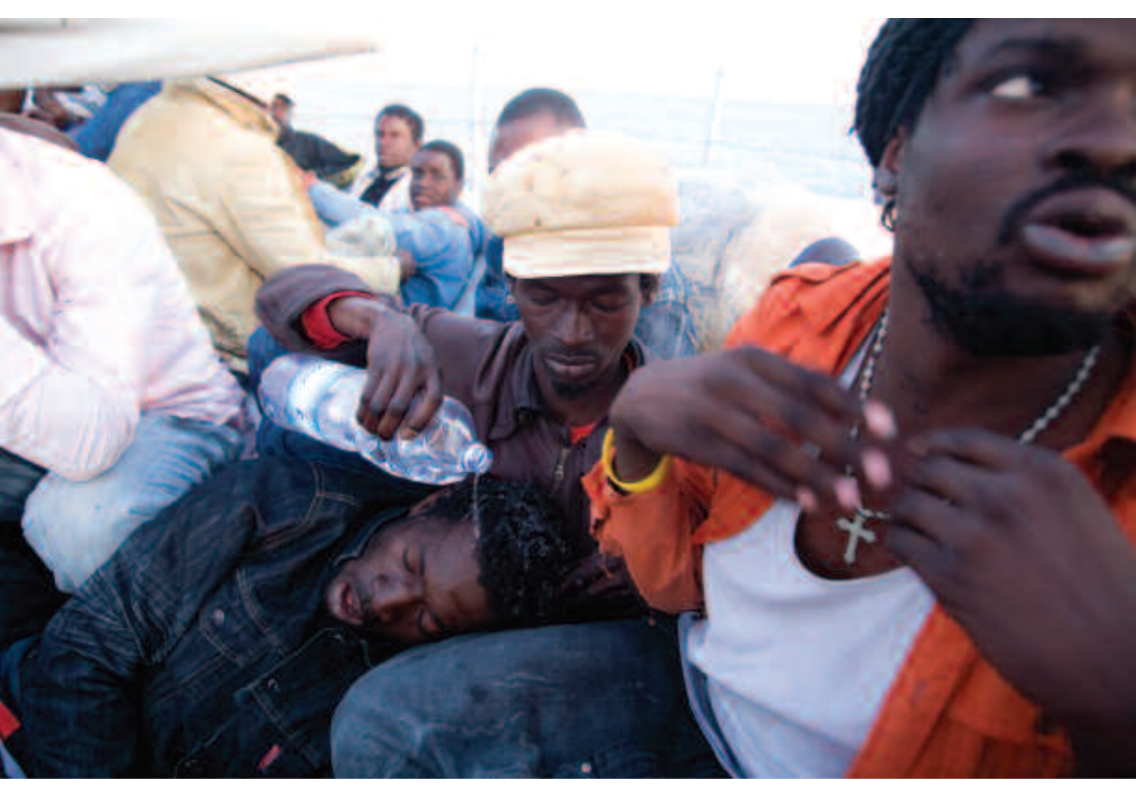
A man pours water over a dehydrated fellow migrant.

whatsoever. Various international conventions bar governments from committing refoulement—the forced return of people to places where their lives or freedom would be threatened or where they would face a risk of torture. The principle of nonrefoulement is a binding obligation in international human rights law and international refugee law, as well as European and Italian law, which also forbid Italy from returning people to places where they would face inhuman and degrading treatment.