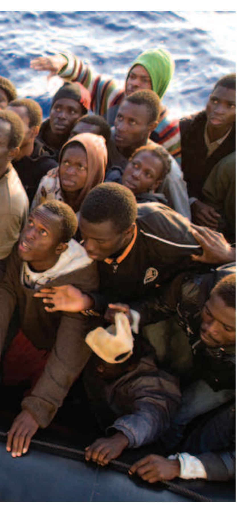
The irregular migrants attempt to grab onto a ladder to climb aboard the Bovienzo .

convince EU institutions and member states to stop Italy and Frontex from forcibly returning migrants to Libya where they are routinely subjected to inhuman and degrading treatment and where potential refugees are not effectively protected.