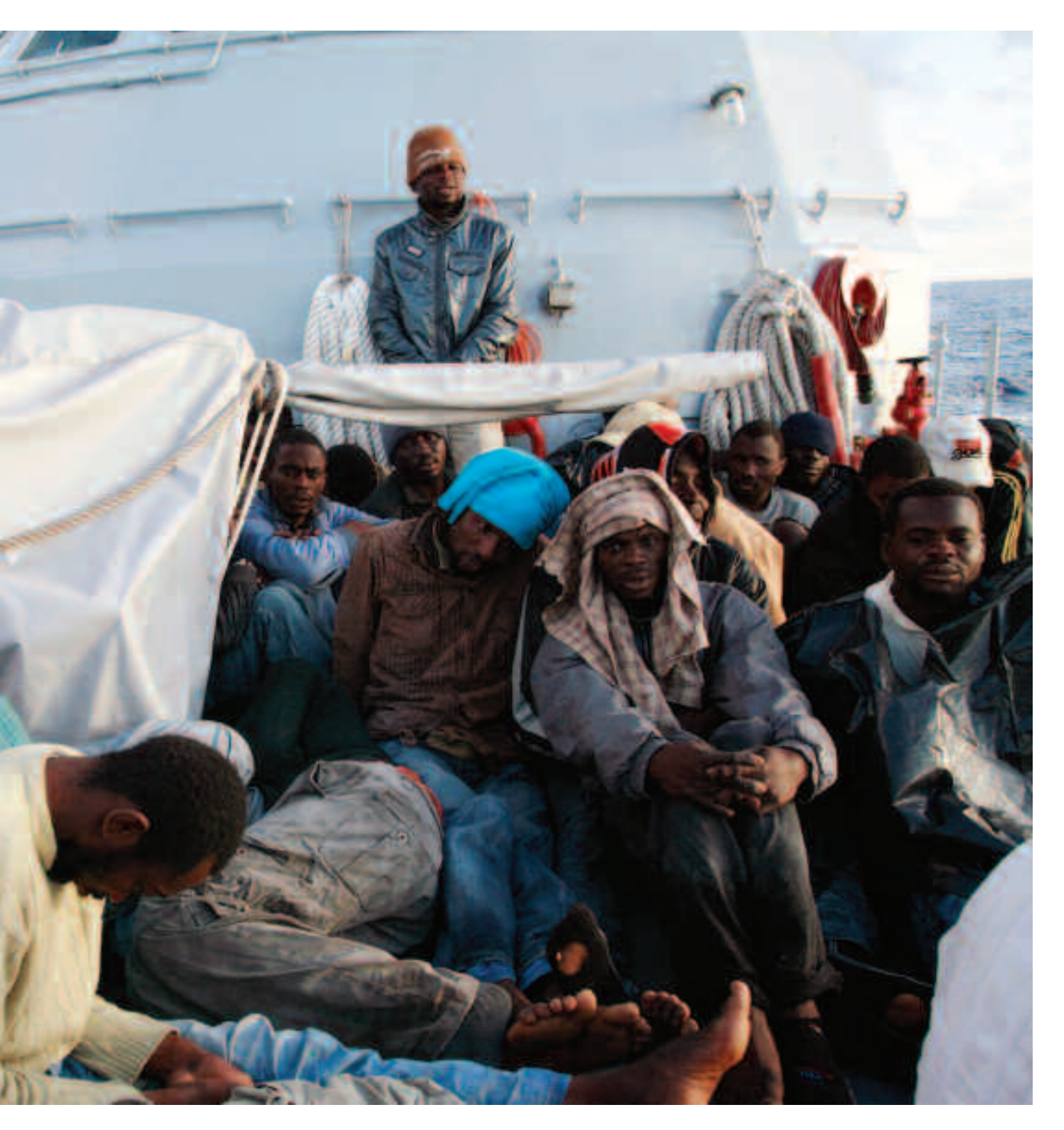
In many cases, migrants traveling through Libya also do not know whether their abusers are police or criminals, but often express the belief that both groups are in league with each other as each exploits and abuses vulnerable migrants.