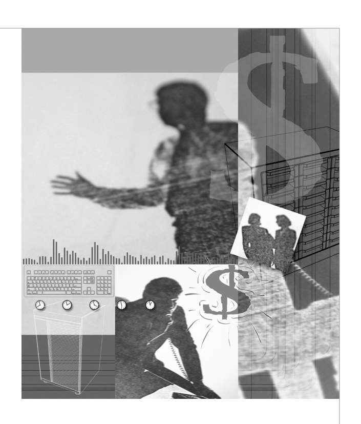
Task Force Member Contributions