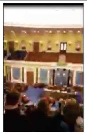
Screenshot of video provided by COMPLAINANT 1 as recorded by MALDONADO