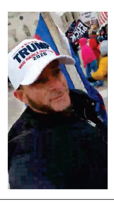
Screenshot of video provided by COMPLAINANT 1 of MALDONADO