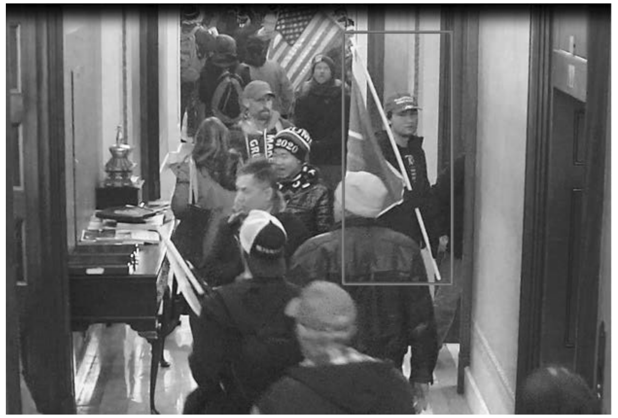
Figure 6 – H227 Hallway

SECOR appears to be carrying the same blue America First flag.