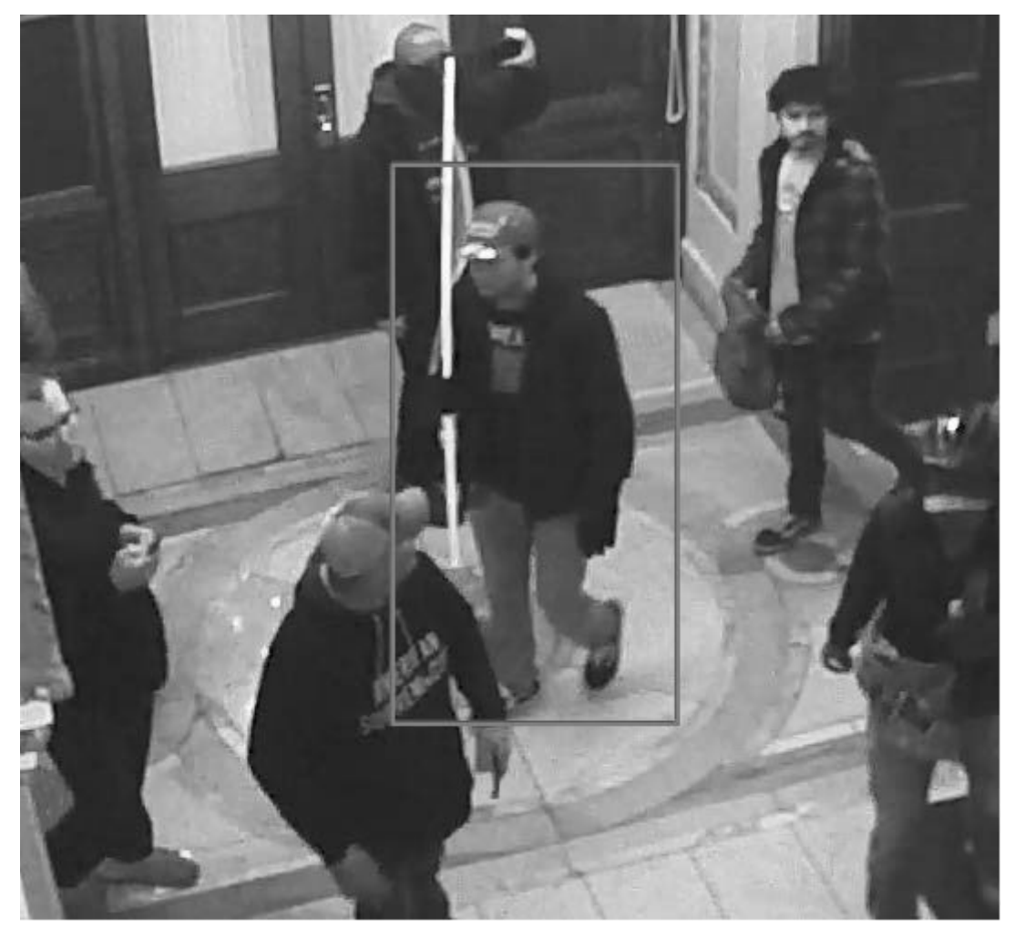
Figure 9 - H230 Hallway