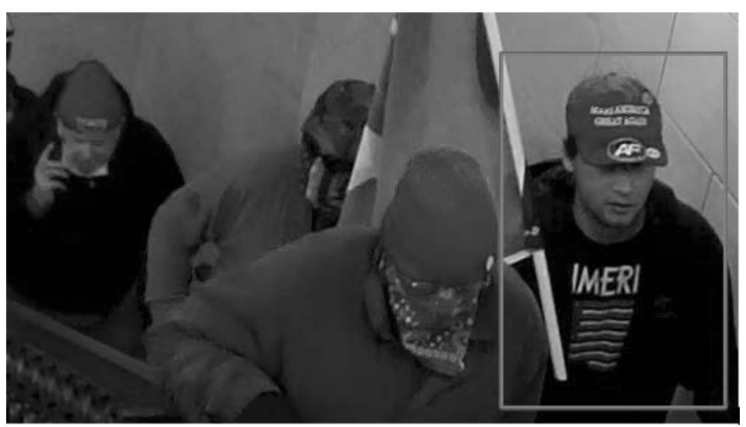
Figure 11 - Gallery Stairs

18. In one of the videos provided by the U.S. Capitol Police, SECOR can be seen among a group of rioters attempting to push through a doorway that is blocked by no less than three police officers, thereby impeding an the performance of their duties, and breaking through a police line.