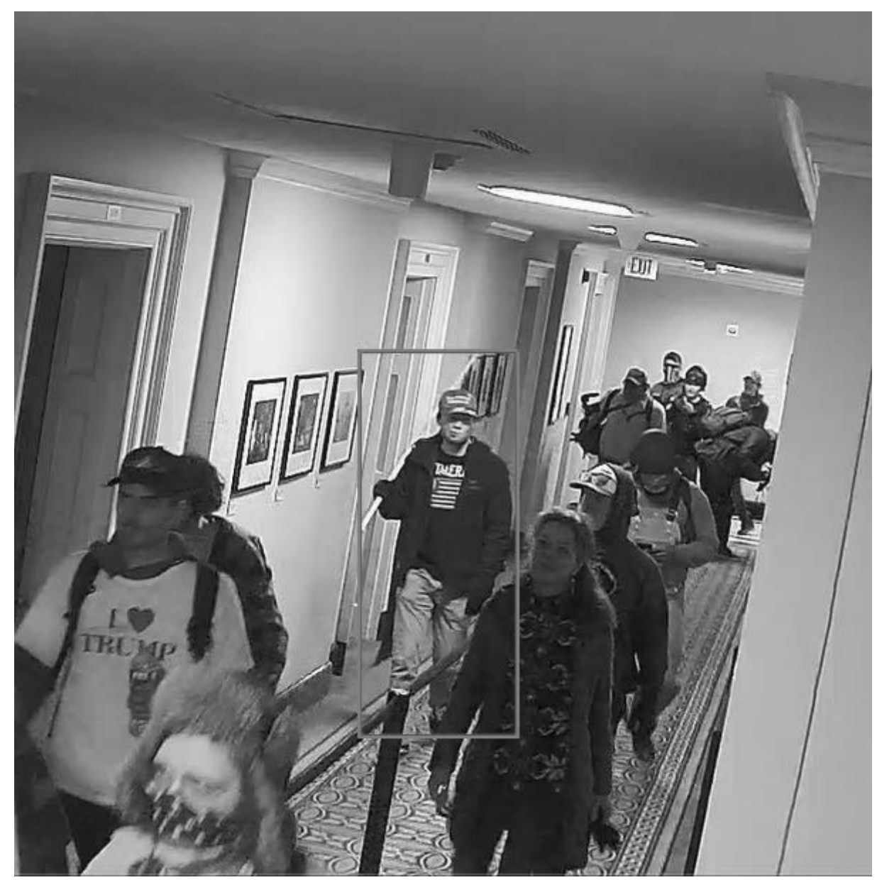
Figure 7 - East Corridor near S306