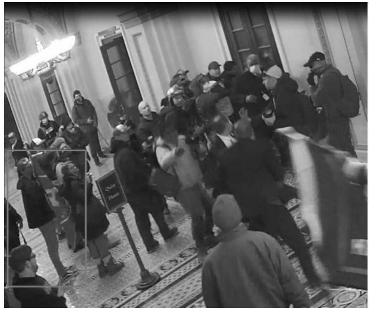
Figure 8 - Senate Gallery SE near S309