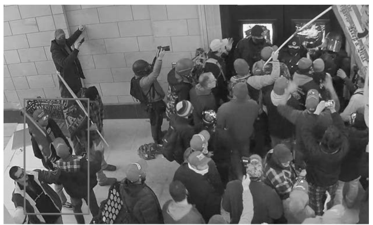
Figure 10 - Rotunda Door Interior