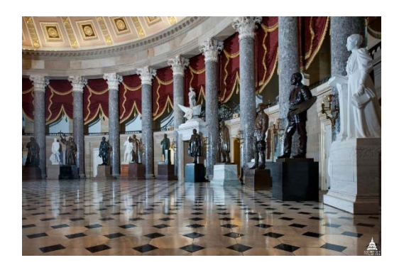
U.S. Capitol surveillance video also captures the SPENCERS inside Statuary Hall. See the below redacted surveillance video still shots.