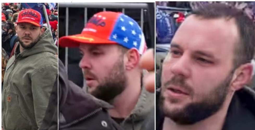
Images 1 (left), 2 (middle), and 3 (right): Images depicting the individual identified as “#152 – AFO”

Since January 6, 2021, the FBI has been investigating and identifying those who were inside of the Capitol without authority and disrupted the proceedings. The FBI preliminary identified the individual in the images below as “#152 – AFO”: