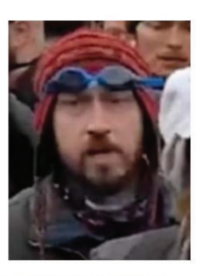
Photograph #328 - AFO A