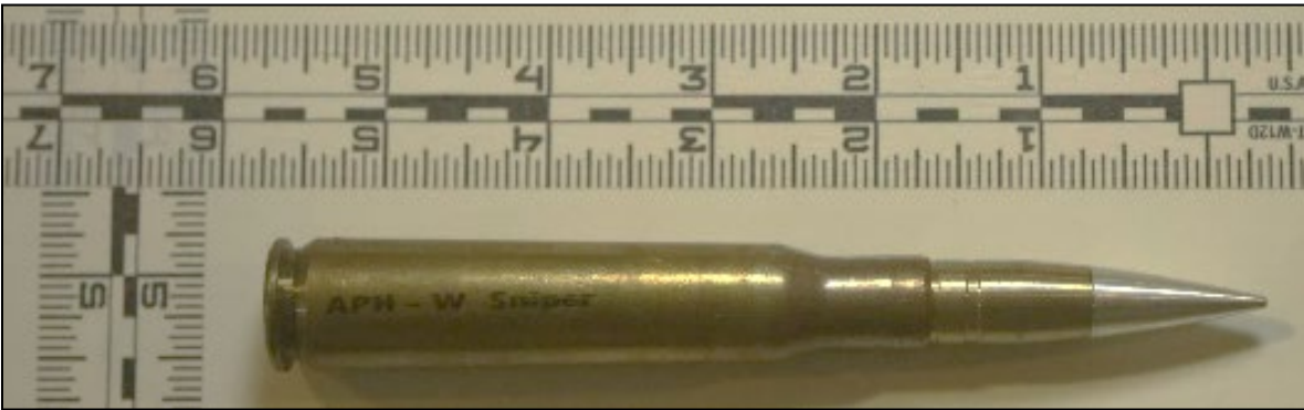
24,000 rounds of 12.7mm ammunition