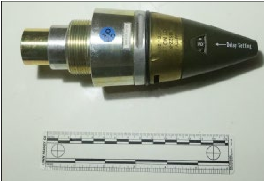
6,960 proximity fuses for rocket-propelled grenades