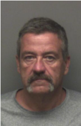
Photograph taken 2021