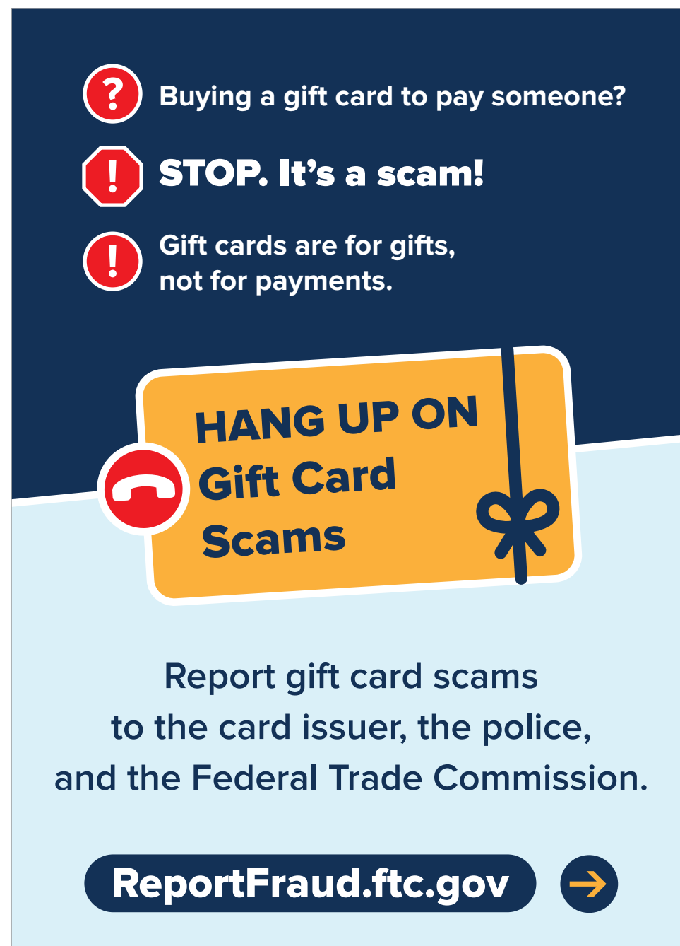
Back option 1