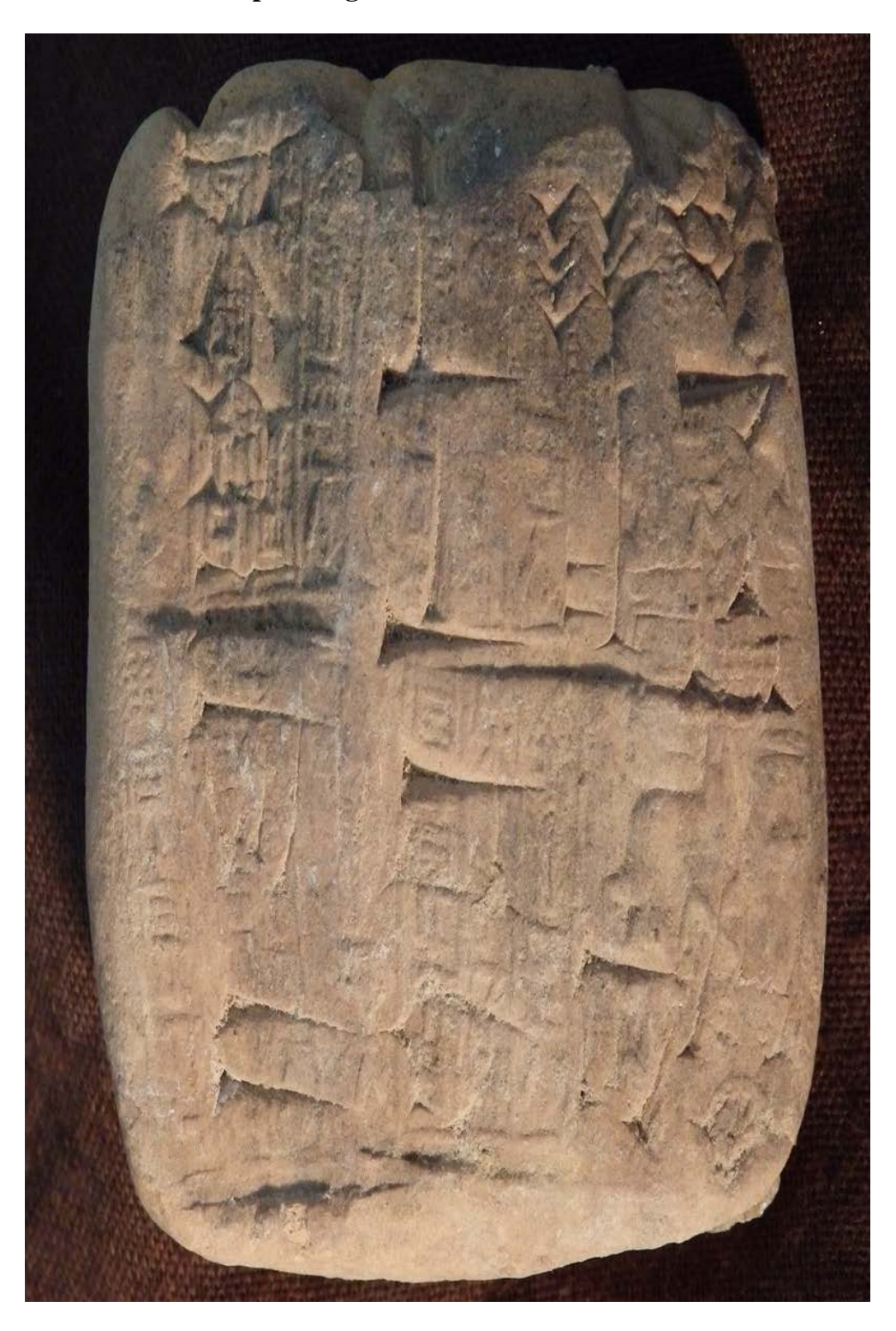
Exhibit A Sample Images of the Defendants in Rem