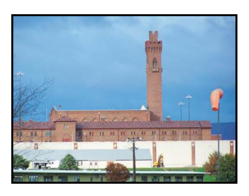
USP Lewisburg—High security U.S. Penitentiary with an adjacent minimum security satellite camp.