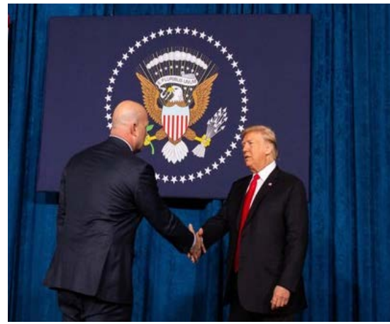
President Trump spoke to U.S. Attorneys and law enforcement partners at the Project Safe Neighborhoods Conference held in Kansas City, Missouri on December 7, 2018.

our state and local law enforcement partners, we can ensure that limited law enforcement resources are being brought to bear in the most effective way possible to protect the people we serve.