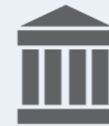
On-Campus Title IX Office