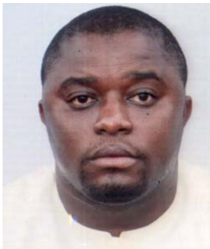
Photograph taken in 2014

Conspiracy to Commit Wire Fraud; Identity Theft; Access Device Fraud