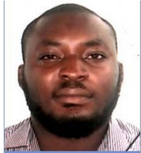
Photograph taken in 2014