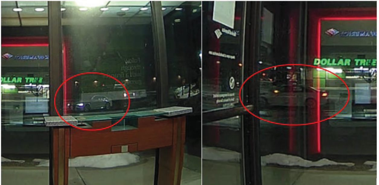
Images 3 (left) and 4 (right): screenshots from video footage depicting the Sedan (circled in red)

it left around the same time as the stolen U-Haul.