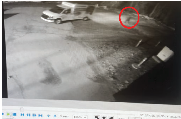
Image 6: screenshots from video footage depicting the U-Haul pulling behind the building with a suspect in dark clothing on foot (circled in red)

10. Approximately seven (7) minutes later, the U-Haul is captured on video surveillance as it arrived at the plaza of the T-Bird Mini Mart and parked behind the building. I observed, via the surveillance video, that the U-Haul then backed up to the loading dock in the rear of the business.