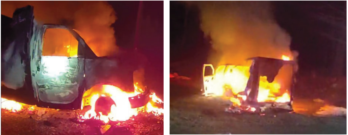
Images 13 (left) and 14 (right): screenshots from body worn camera of burning U-Haul truck.

the U-Haul appeared to be purposely set on fire.