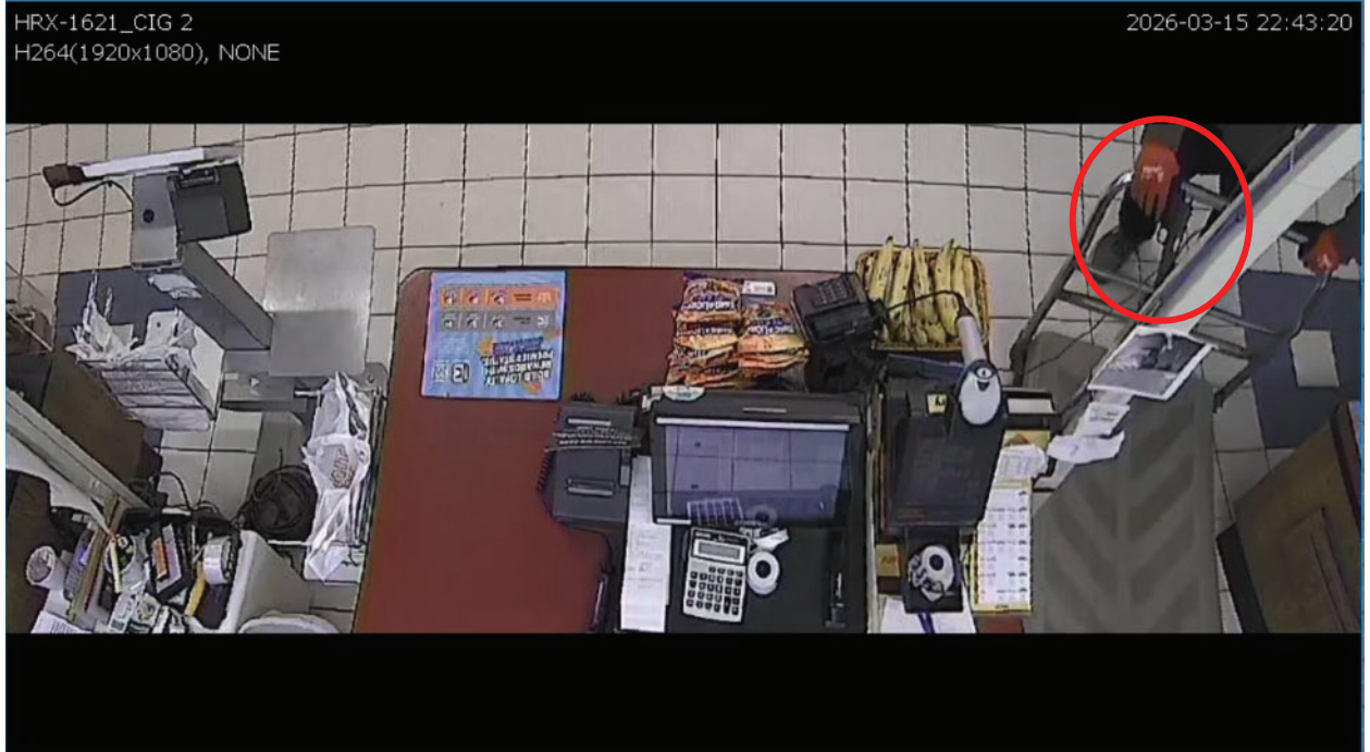
Image 7: screenshot from video footage depicting Suspect #1 holding what appeared to be a 1911-type pistol (circled in red)