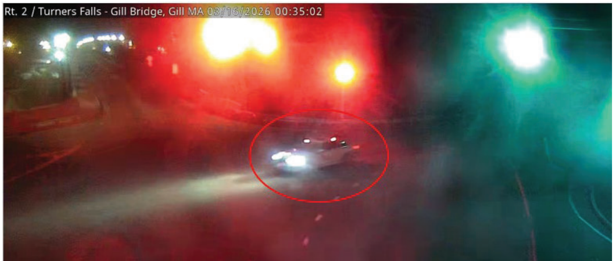
Image 12: screenshot from MA DOT video footage depicting the white sedan (circled in red) traveling in Gill, Massachusetts on March 16, 2026