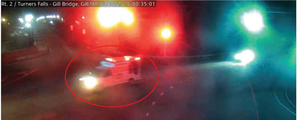
Image 11: screenshot from MA DOT video footage depicting the U-Haul truck (circled in red) traveling in Gill, Massachusetts on March 16, 2026