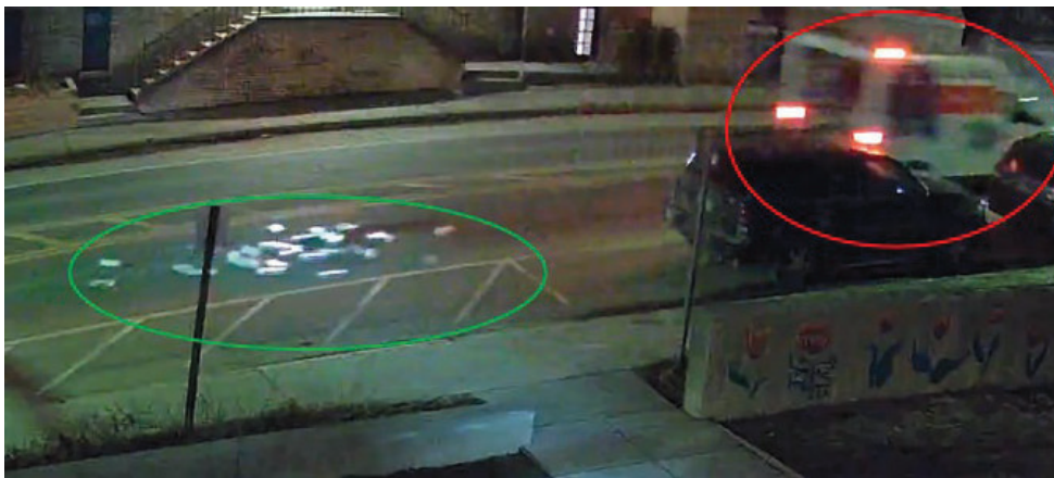
Image 10: screenshot from video footage depicting a U-Haul truck (circled in red) and cigarette cartons (circled in green) in the middle of the roadway on March 15, 2026

17. I, along with other ATF agents, observed multiple surveillance videos wherein the U-Haul is observed traveling from Hinsdale, New Hampshire, through Vermont, and into Massachusetts. I observed that additional boxes of cigarettes fell out of the rear of the U-Haul in Brattleboro, Vermont. Employees from the T-Bird Mini-Mart calculated the total value of the cigarettes that fell out of the truck to be approximately $50,389.81 in United States Currency.