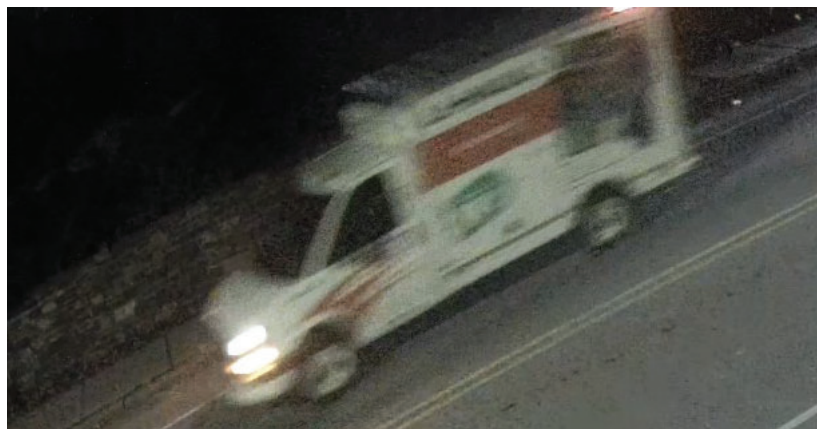
Image 5: screenshots from video footage depicting the Stolen U-Haul traveling northbound on Canal Street

9. On March 15, 2026, I observed video surveillance footage obtained from a business in Brattleboro, Vermont, that showed that, on or about March 15, 2026, at approximately 10:40 p.m., a U-Haul truck traveled northbound on Canal Street towards Hinsdale, New Hampshire.