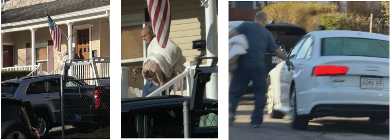
Images 15 (left) and 16 (center) and 17 (right): surveillance photos taken by ATF Task Force officer on or about April 15, 2026.