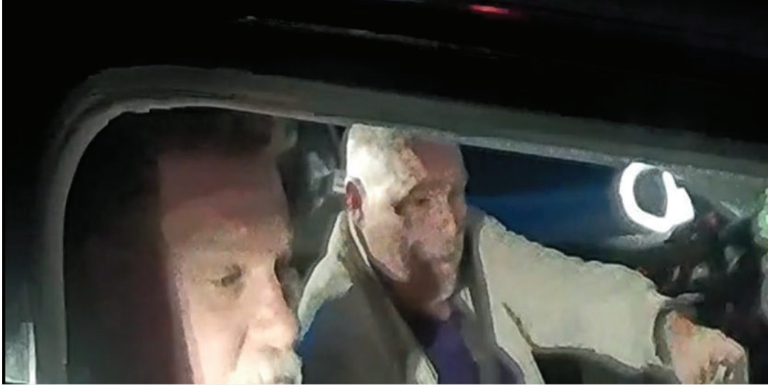
Image 19: Snippet from MSP Bodycam video during April 5, 2026, traffic stop.