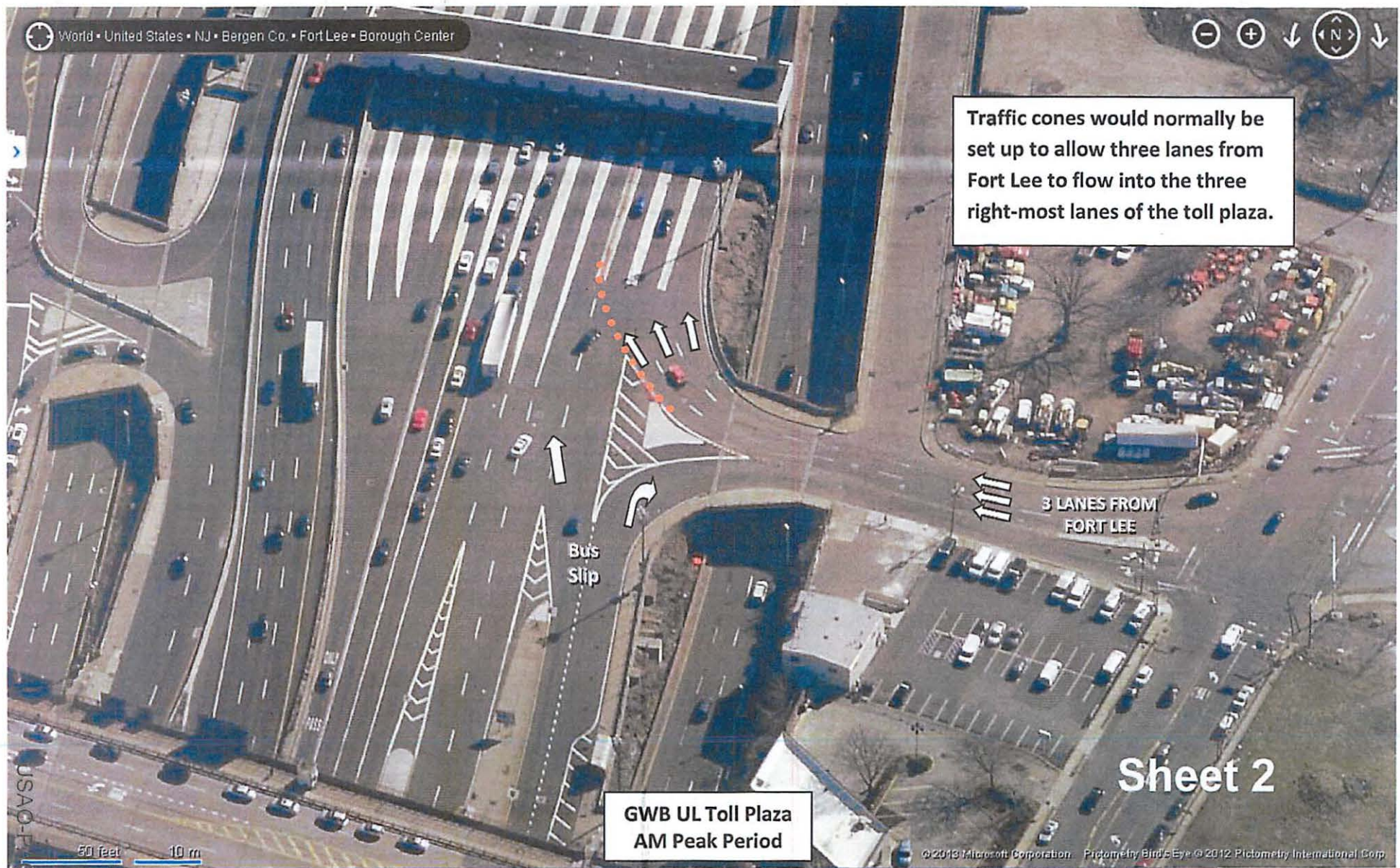
GWB UL Toll Plaza AM Peak Period

Traffic cones would normally be set up to allow three lanes from Fort Lee to flow into the three right-most lanes of the toll plaza.