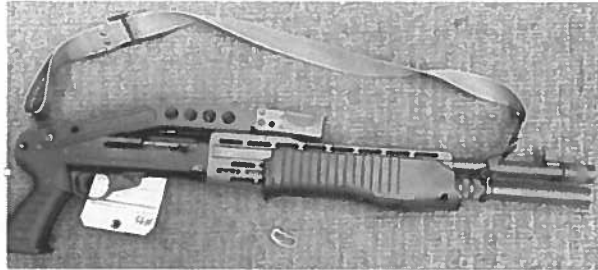
March 2019 fraud against victim J [REDACTED] V [REDACTED]