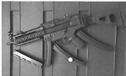
September 2019 fraud against victim R [REDACTED] H [REDACTED]