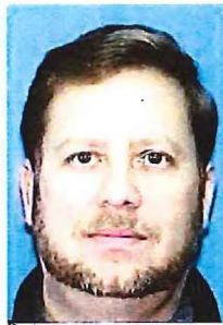
Hall – Passport (2007)