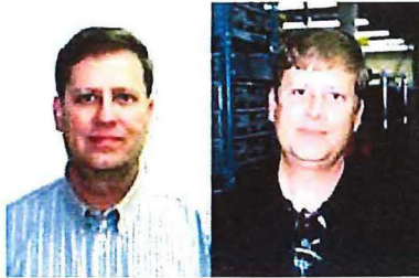
Hall – Minnesota DMV (11/2001)