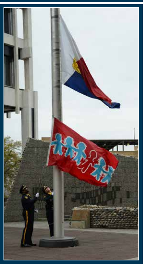
The U.S. Attorney's Office participated in a ceremony sponsored by the Memphis Child Advocacy Center to raise awareness about child abuse. Members of the Memphis Police Department Color Guard raise the memorial flag as part of the ceremony.